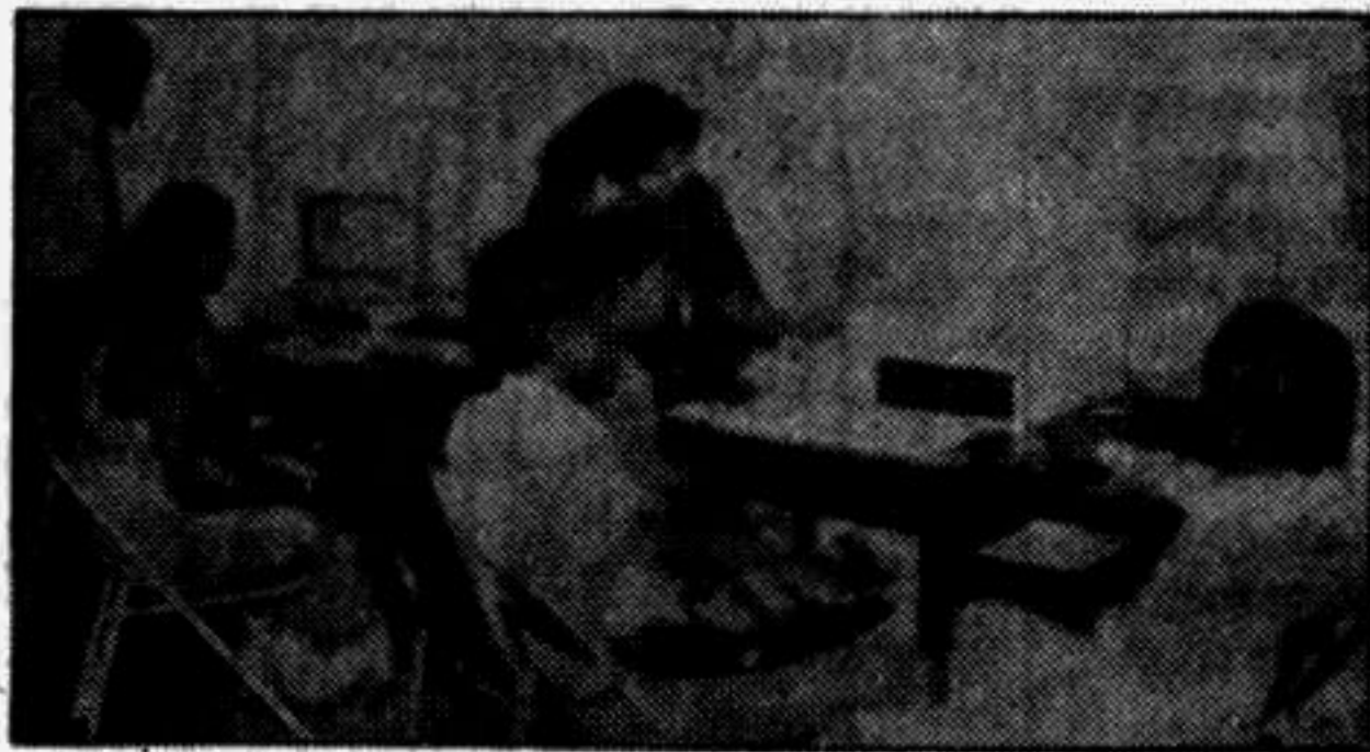
Talking at leisure

As for the clubs, the men go there not only to swim or play tennis or practice golf, and keep fit, or even exchange a hand of cards, but certainly also to meet their friends, chat, and air their views.