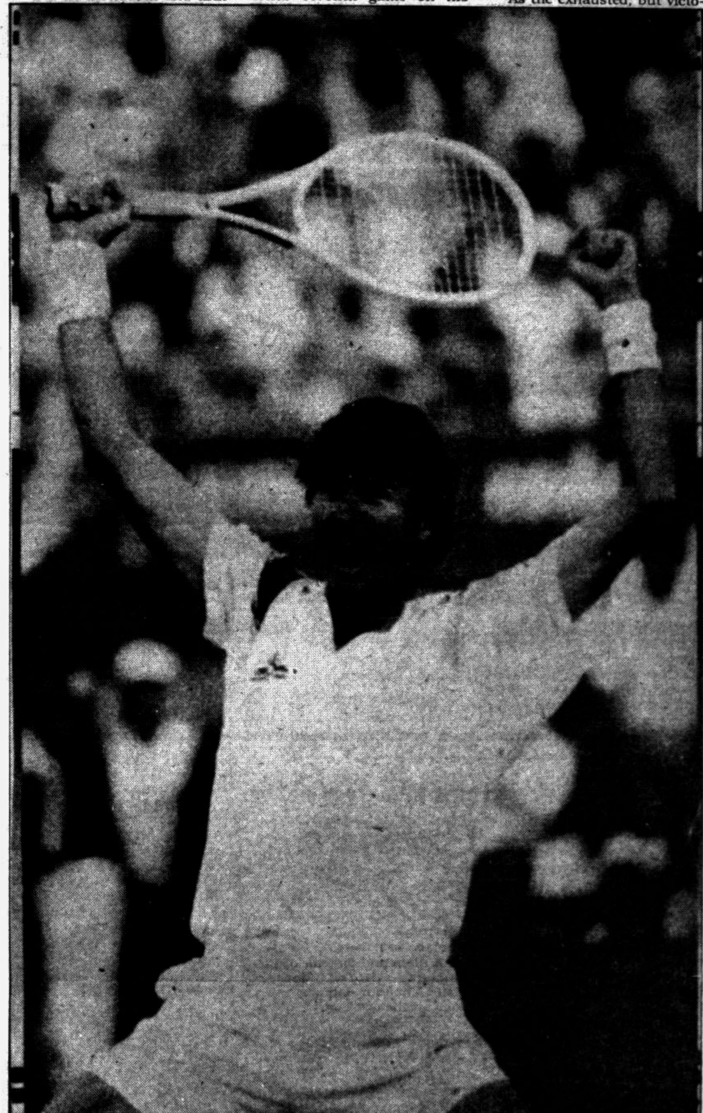
Jimmy Connors of the US screams in celebrations of his US Open victory over compatriot Aaron Krickstein on Sept 2. Connors was victorious on his 39th birthday by a score of 3-6, 7-6, 1-6, 6-3, 7-6.

sets he again began fighting his way to the net in an effort to shorten points against the 24-year-old Krickstein, who only