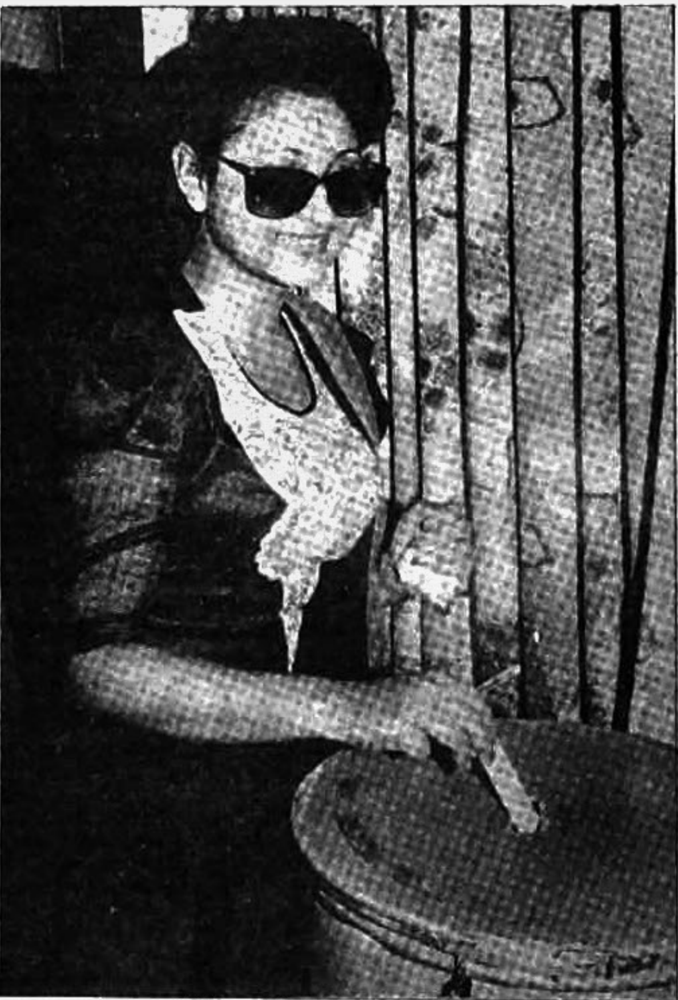
Film star Rani casting her vote in the election of the Film Artists Association at FDC on Friday.

Later the Minister formally inaugurated the office of the association.