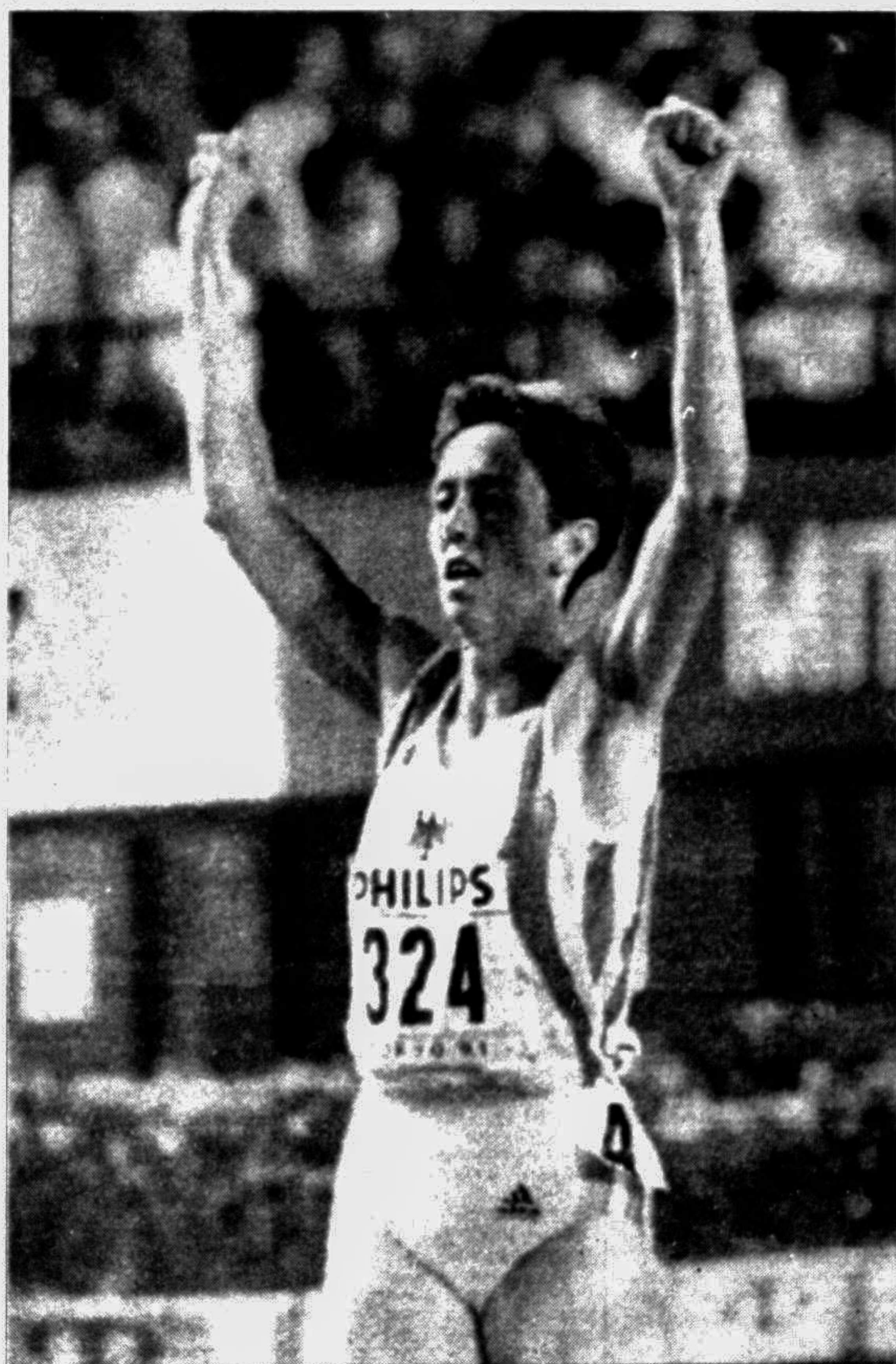
Sabine Braun of Germany raises her arms after the final 800m race of women's seven-event heptathlon competition in the World Athletics Championships in Tokyo on August 27. Sabine Braun won the event with 6,672 points, ahead of the Romanian Lilian Nastase.

Sabine Braun of Germany gave European women a golden hat-trick when she won the heptathlon with 6,672 points but with the absence of