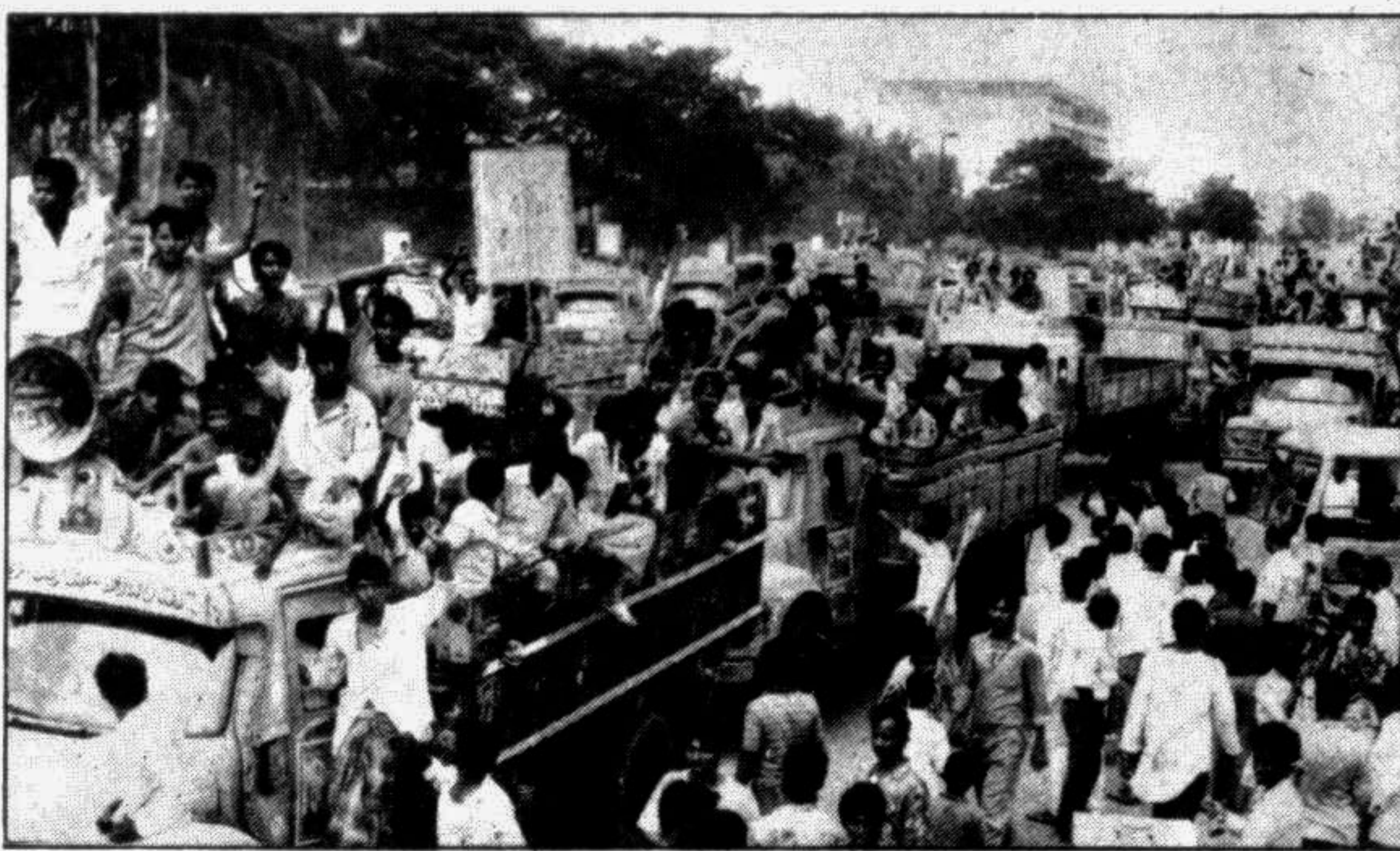
A truck procession in the city in protest against fuel price yesterday. Story on p-12

WASHINGTON, Aug 27: The Bush administration will keep US troops in Kuwait longer than previously planned to provide protection for the war-ravaged nation, the Defence Department said Tuesday, reports AP.