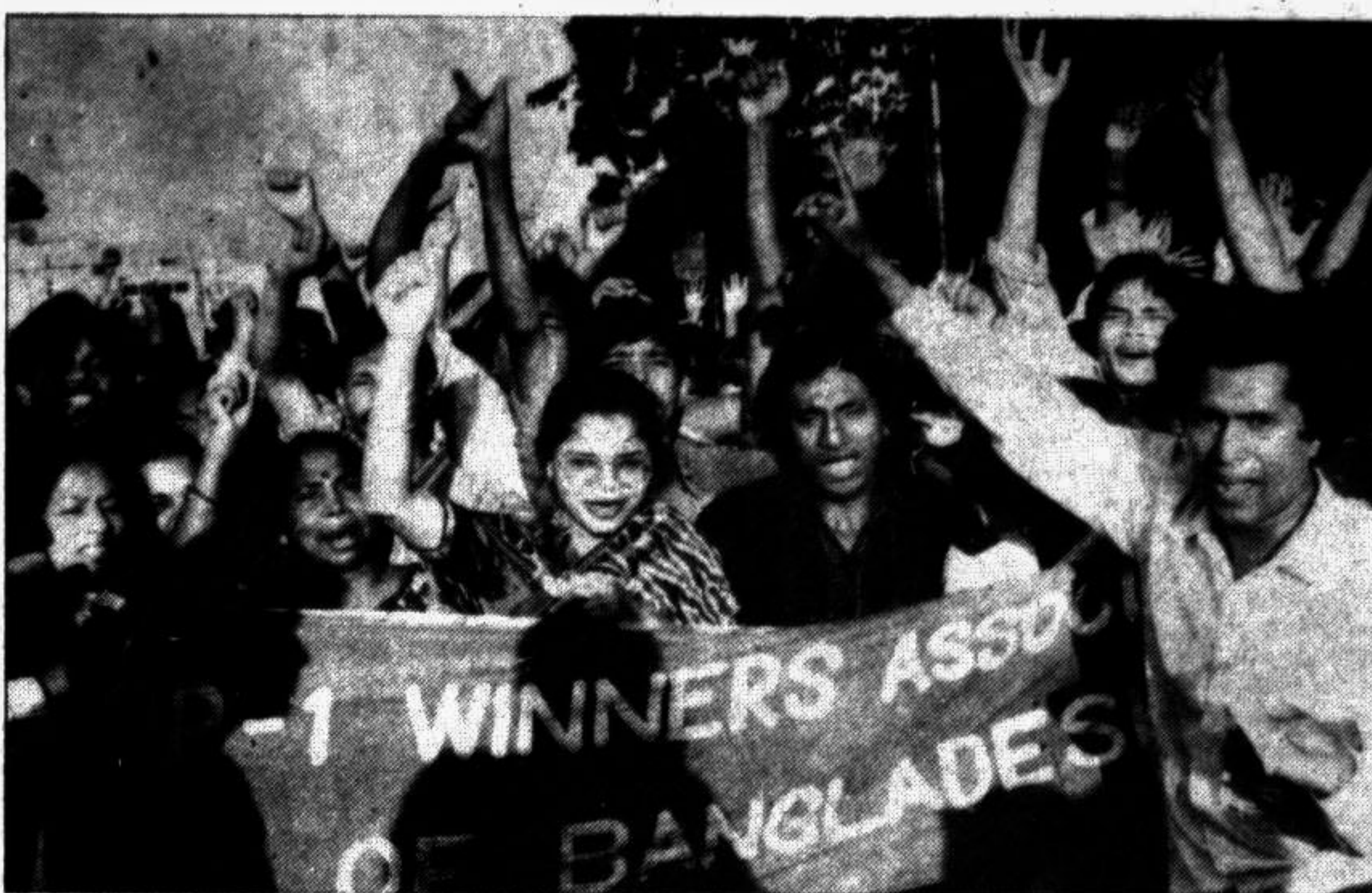
Winners of US OP-1 brought out a procession in the city on Monday in protest against alleged suspension of issuance of visas. Story on Page -1.