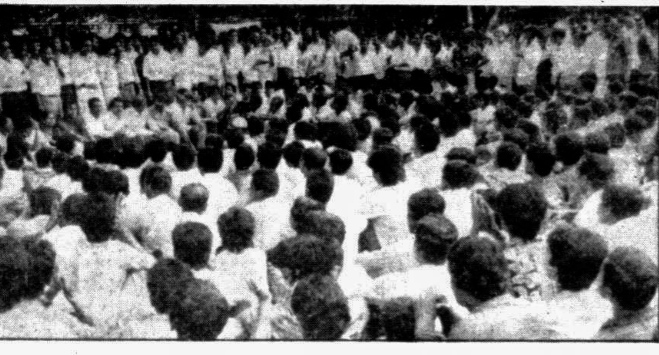
Unemployed youths held a rally near the Secretariat yesterday decrying the new pay scales.

By Staff Correspondent Several thousand citizens most of them said to be unemployed held a rally on Monday in front of the National Press Club demanding recruitment in place of the striking government employees. The rally under the banner of the Dhaka Social and Moral Development organisation also demanded cancellation of the newly announced pay scale and See Page 12 Col. 1