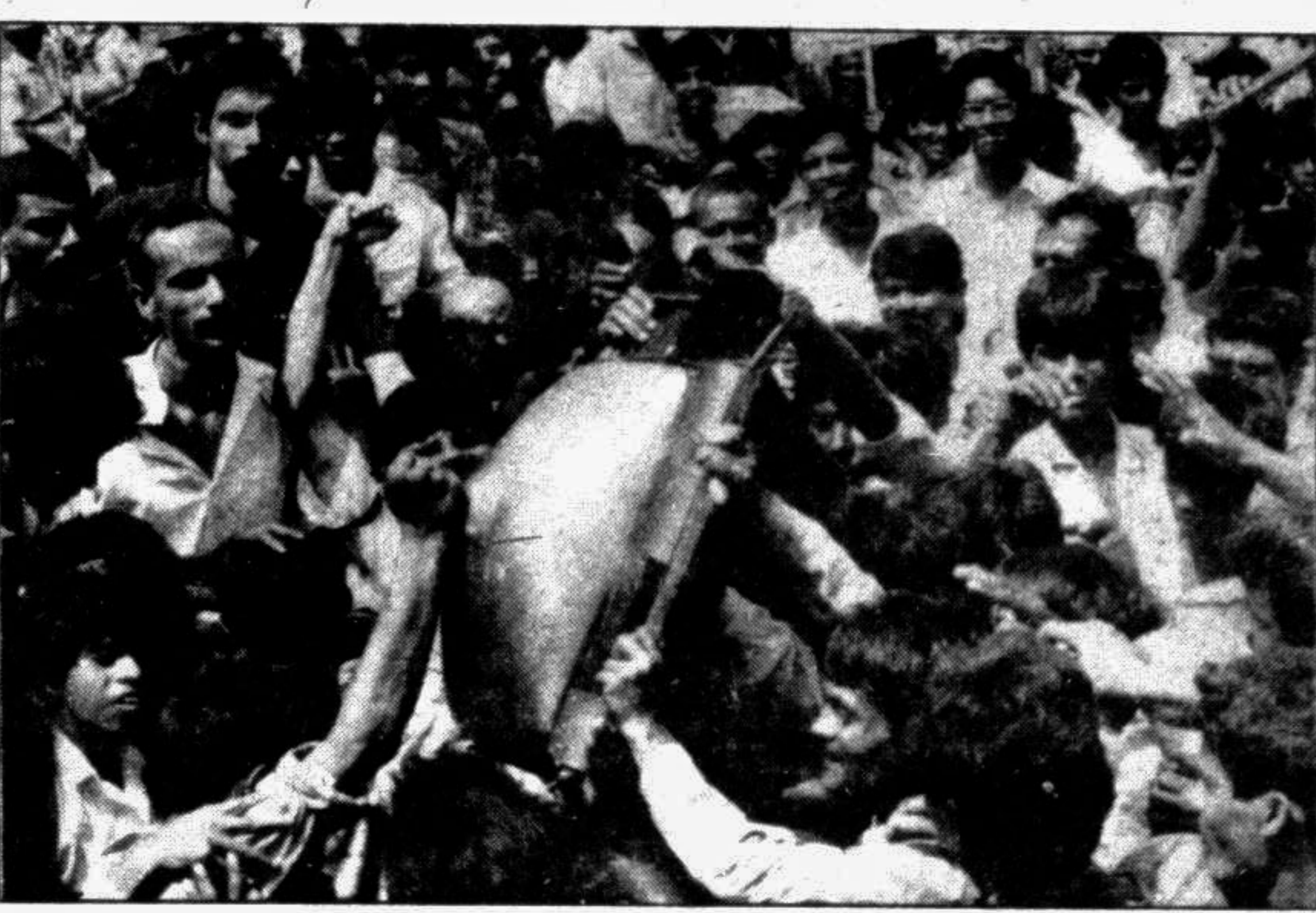
AL supporters smashing a TV set near TV Bhaban yesterday in protest against government policy on the electronic media.