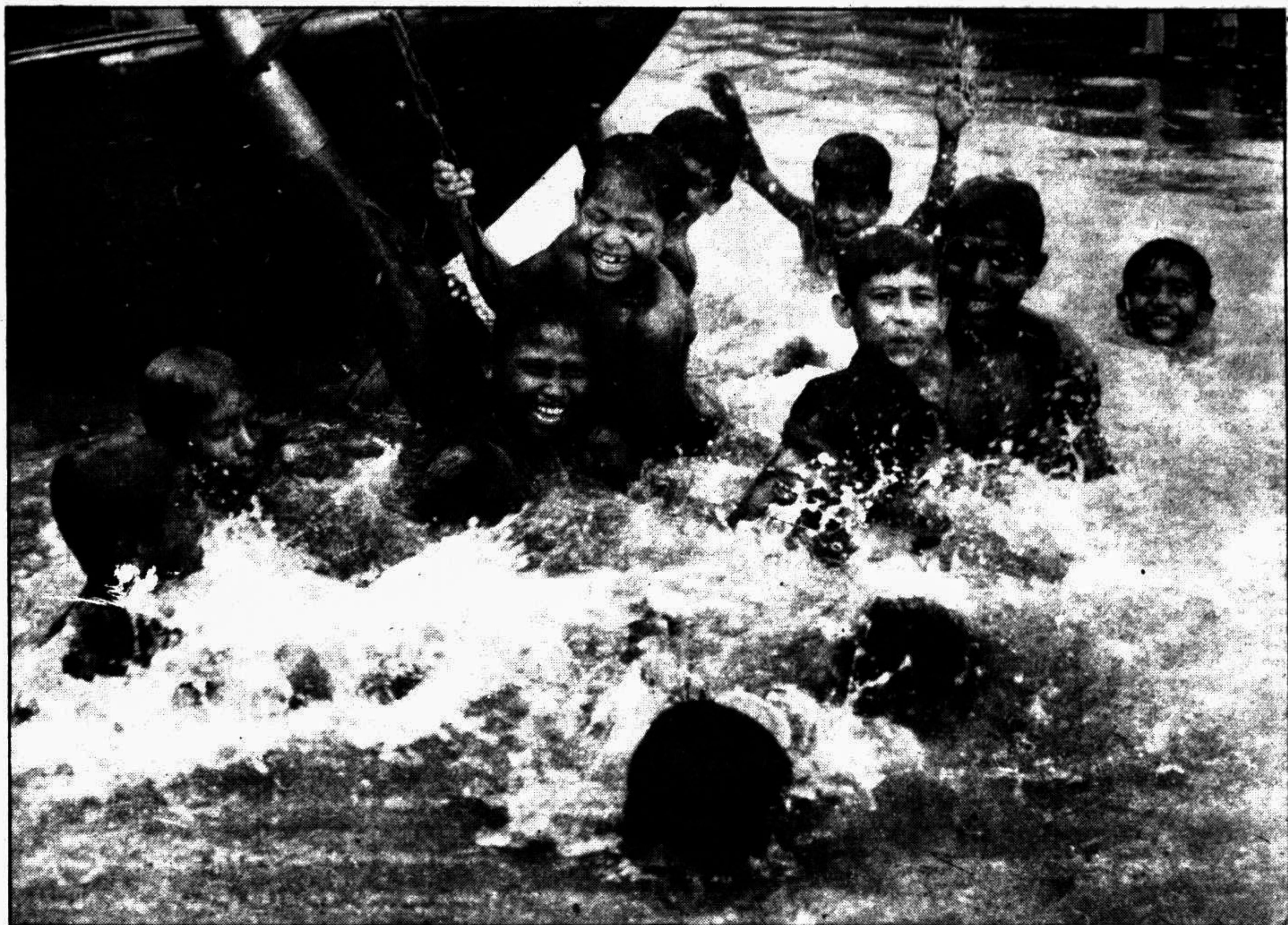
With the advent of monsoon khals, beels, rivers and other water bodies are filled to the brink. Photo shows a bunch of frolicking children taking dip in the water in the scorching summer heat at Kanchpur in Narayanganj.