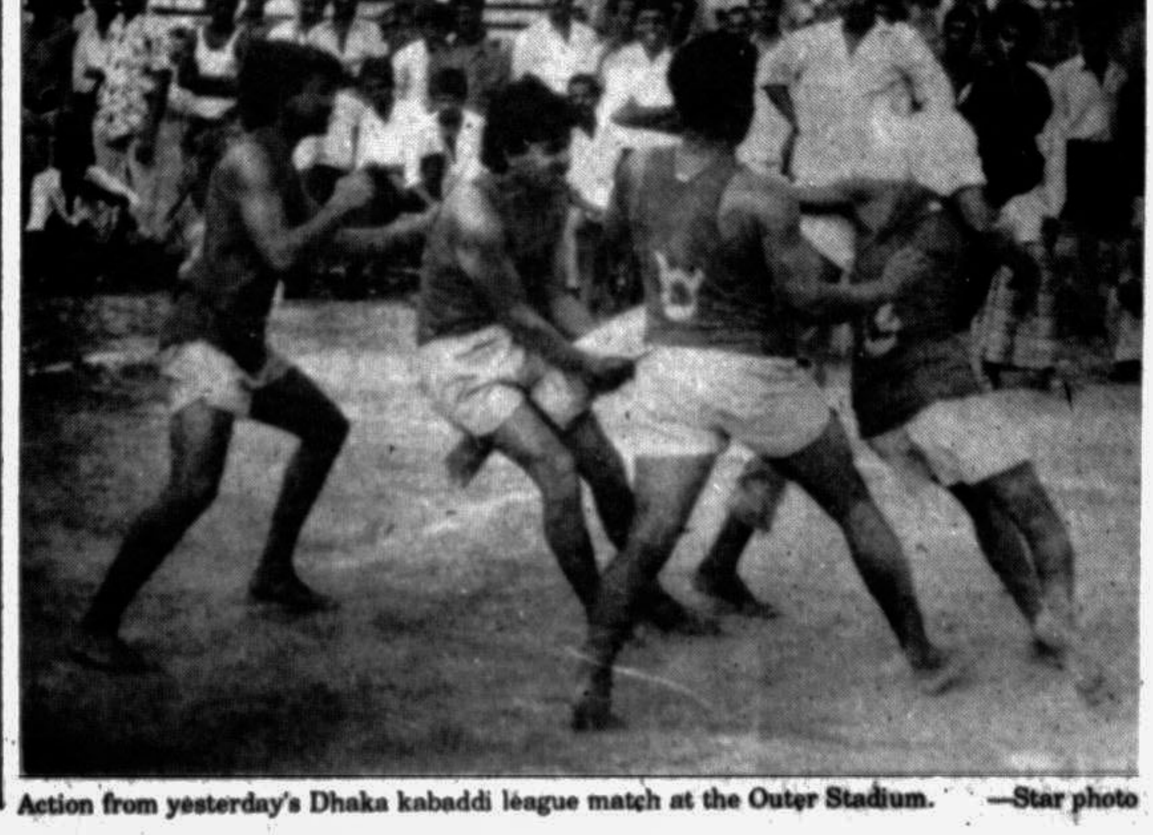
Action from yesterday's Dhaka kabaddi league match at the Outer Stadium.

Sonali Bank Club became Group 'C' champion to move into the quarter-finals of the Dhaka kabaddi league. At the Outer Stadium kabaddi ground yesterday, Sonali Bank outplayed Farooq Smriti Sanghad 30-8 point after leading 14-4 at the breather.