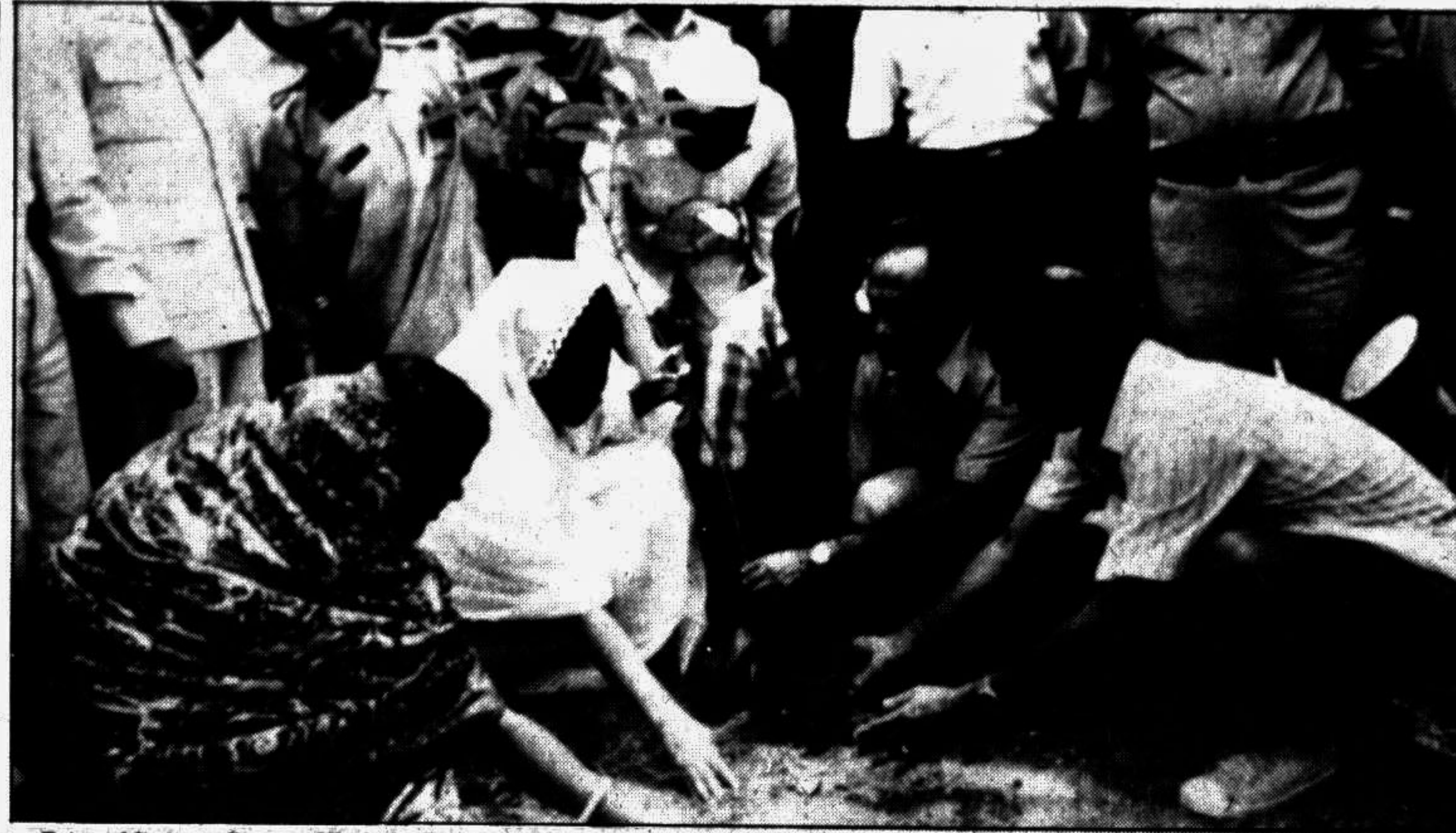
Prime Minister Begum Khaleda Zia inaugurating the national tree plantation programme by planting a sapling at Salna in Gazipur district on August 13.

Standing crops on about 50 thousand acres of land have been completely damaged by flood water and farmers fear they will starve in absence of new grain season.