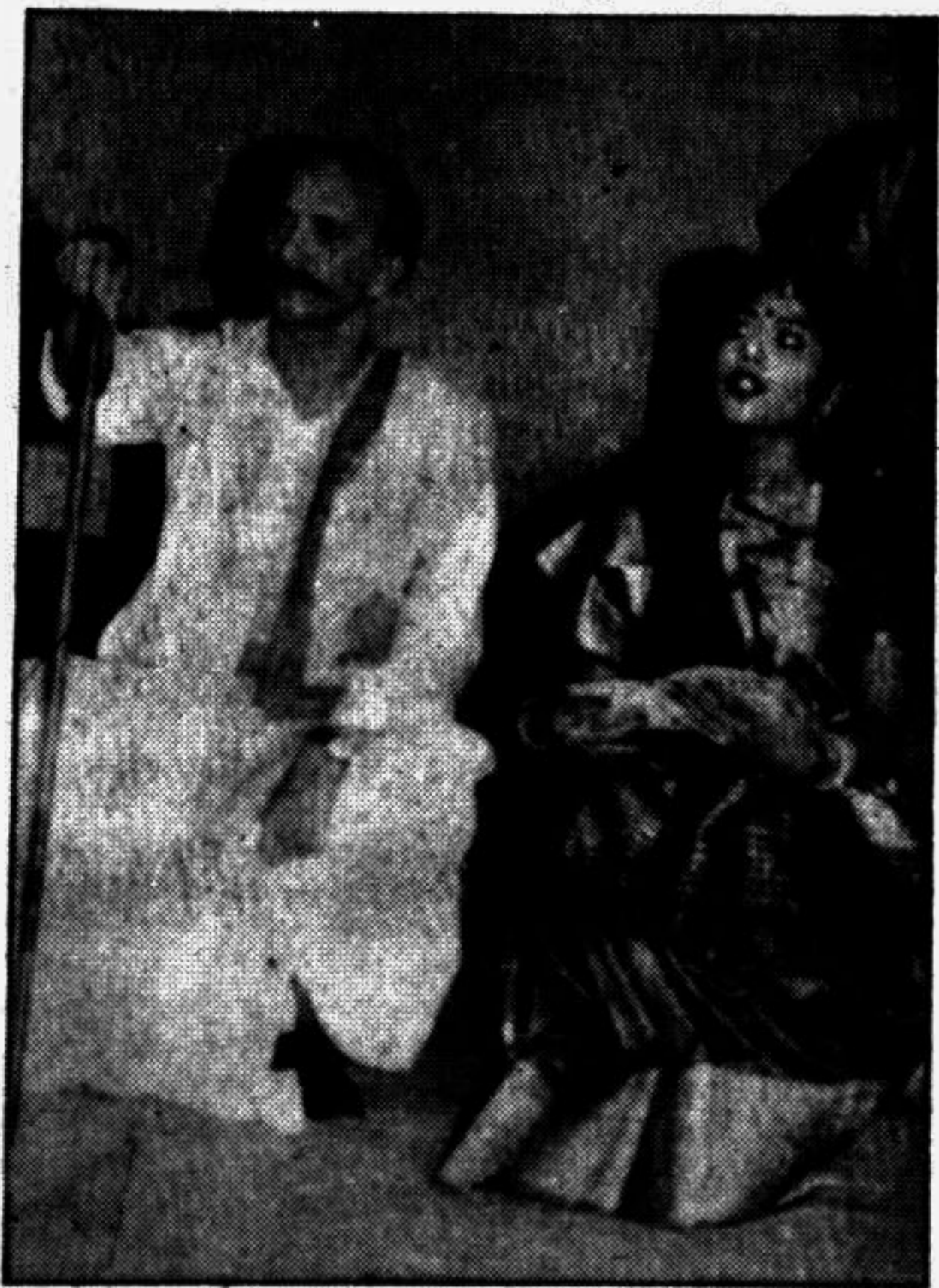
A scene from Drama Circle production 'Kabayo'

The play was staged to collect funds for the deaf for Dhaka Bodhir Shingha at Bijoygar.