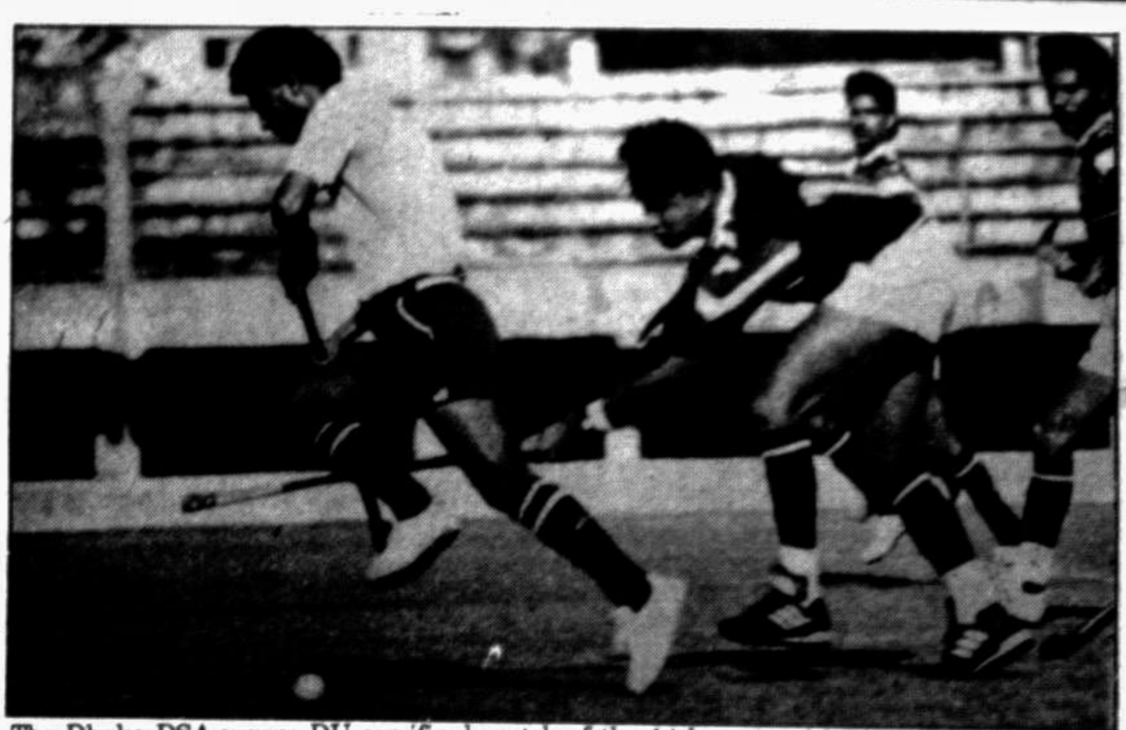
The Dhaka DSA versus DU semifinal match of the 14th national hockey championship in progress at the Hockey Stadium yesterday.