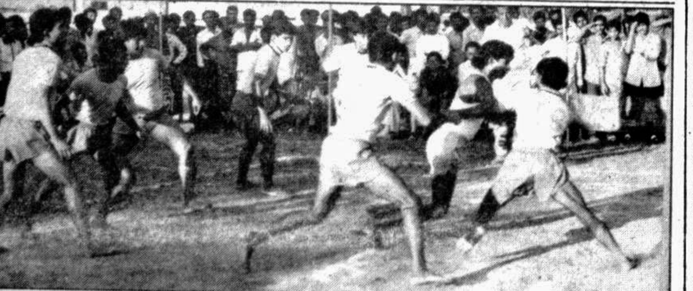
An exciting scene from Azad Sporting v/s Dilkusha Club match in the Dhaka kabaddi league yesterday. Azad won 57-11 and moved into the quarter-finals.