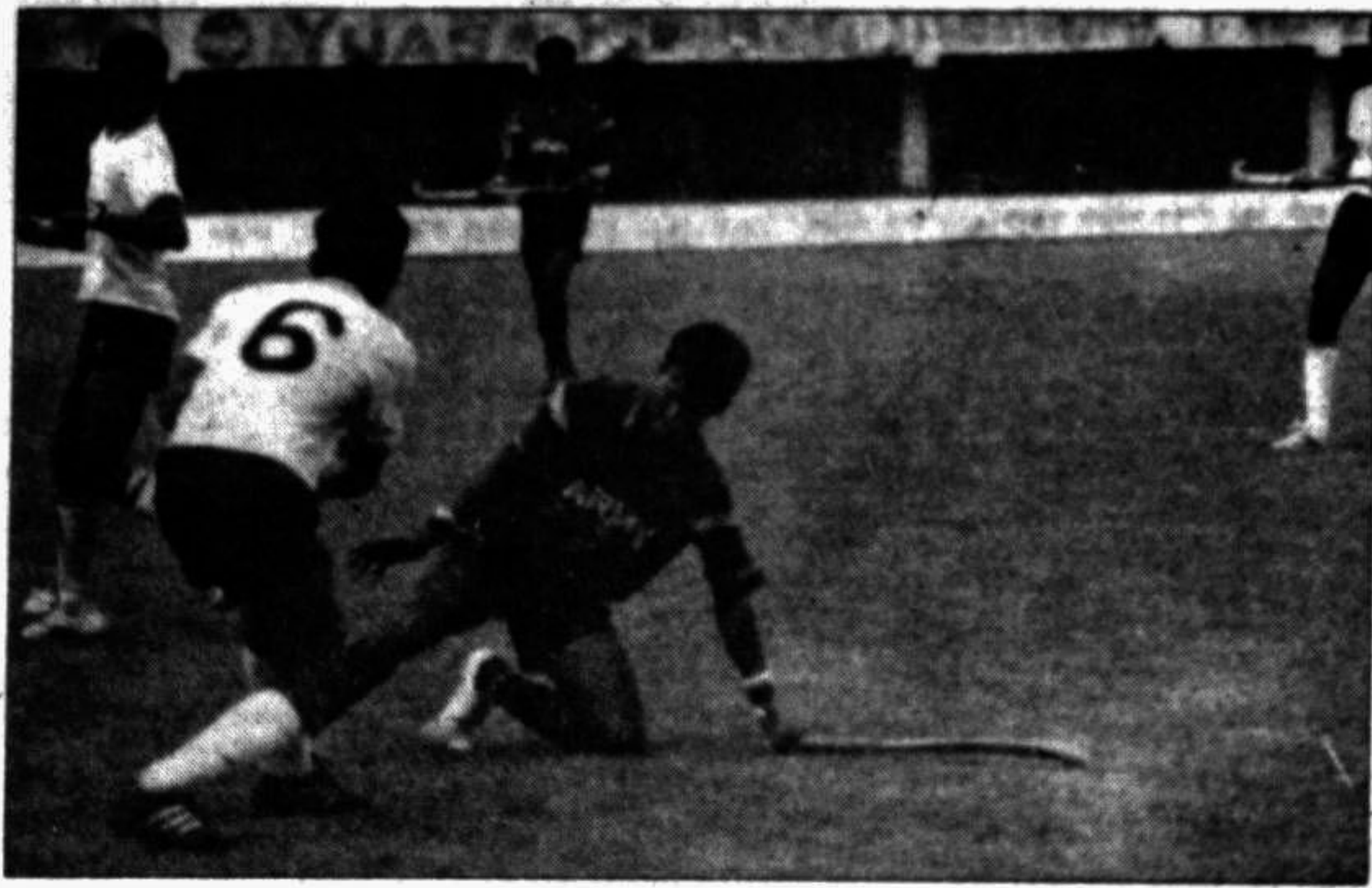
Action from yesterday's national hockey semifinal match between Bangladesh Army and BKSP at the Hockey Stadium. Army won 1-0 and moved into tomorrow's final.