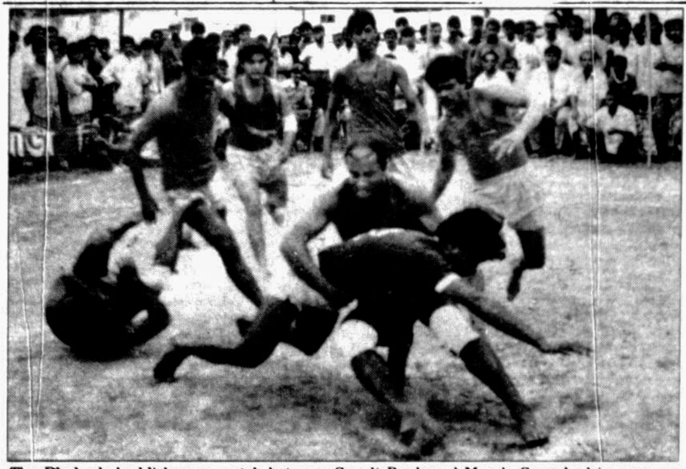
The Dhaka kabaddi league match between Sonali Bank and Manda Sangshad in progress yesterday at the Outer Stadium kabaddi court. Sonali Bank won 13-8.

The semifinals are scheduled for Sunday (August 18) while the final will be on August 20.