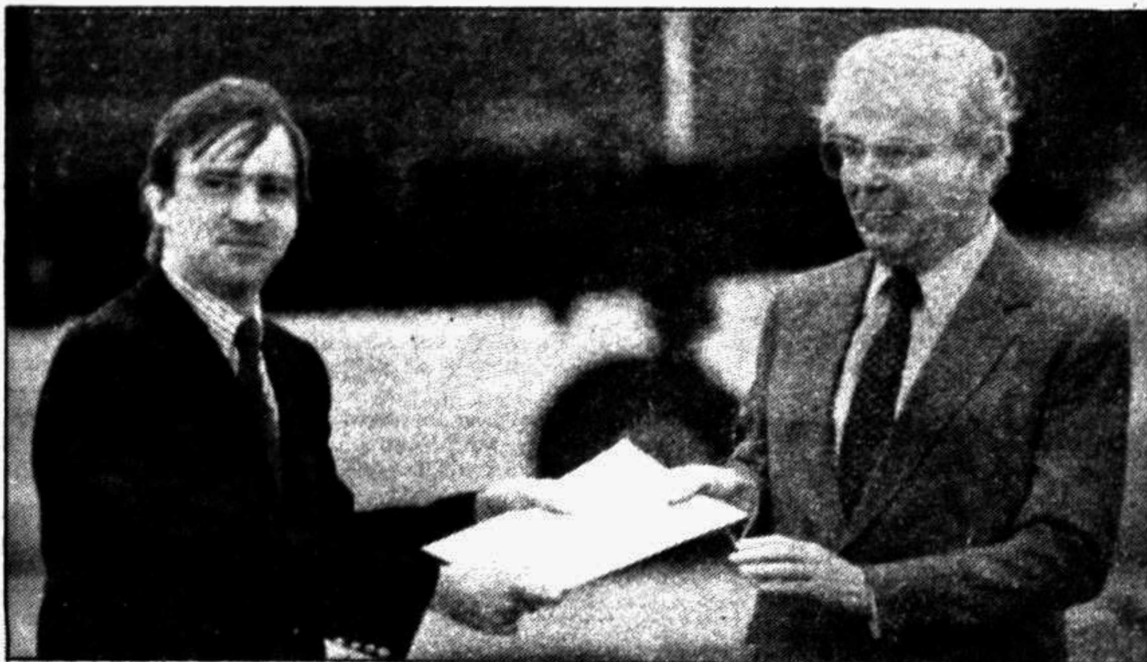
ENGLAND: Journalist and former hostage John McCarthy hands over the letter that he has carried from the Islamic Jihad, who held him captive for five years in Lebanon, to UN Secretary General Perez de Cuellar August 11.