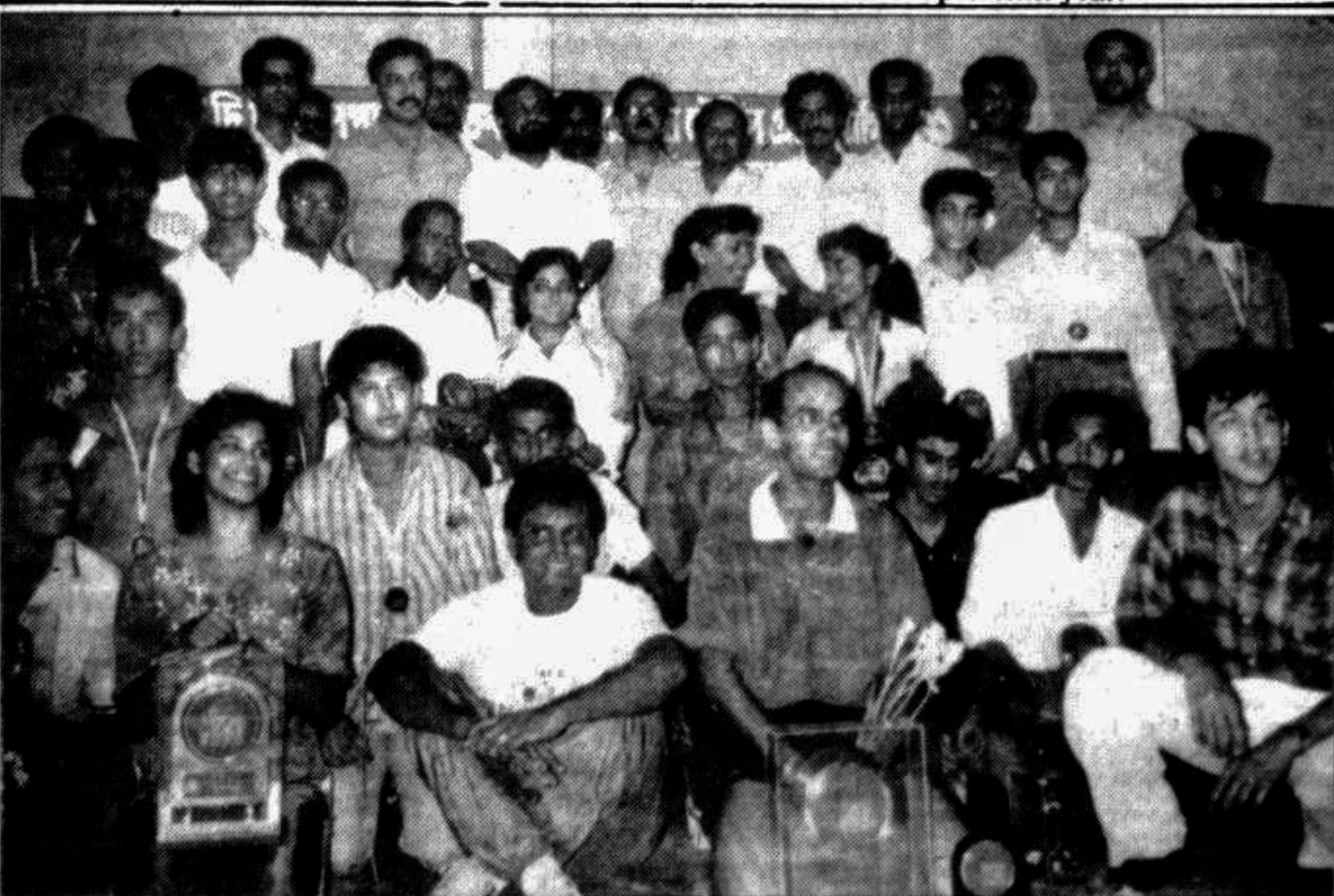
Winners and other participants seen with the guests at the concluding ceremony of the 16th national table tennis championships at the National Coaching Centre yesterday.

The Lancashire batsman has struggled in the current series against the West Indies and was out without scoring on Thursday.