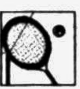
MELBOURNE, Australia, Aug 11: Former world squash champion Jahangir Khan said women

should not be allowed to referee men's squash after he lost the Australian Open here Sunday, his second major tournament loss in a week, reports AFP.