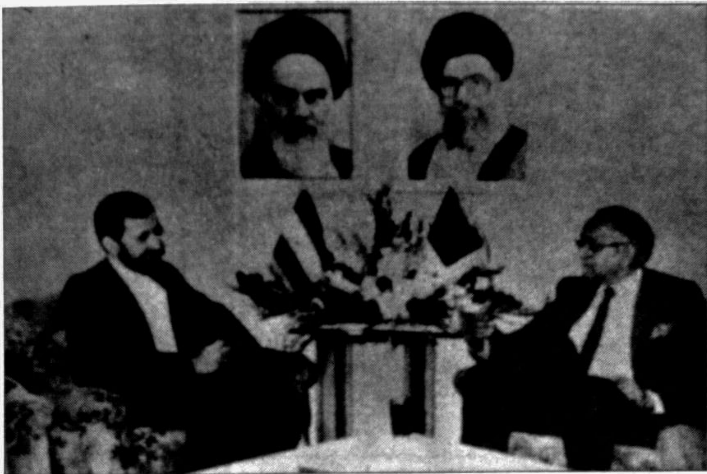
Foreign Minister Mostafizur Rahman called on his Iranian counterpart Ali Akbar Velayati on his arrival at Teheran Mehrabad International Airport on Saturday.

shakeup was preceded Friday by the election as Prime Minister of Vo Van Kiet, 69, a veteran revolutionary who nonetheless has emerged as the leading advocate of Western style economic reform. "Our economy is shifting from a centralised to a market-oriented one under state control, and is gradually scoring new achievements," Kiet earlier told delegates to the National Assembly session which elected him. The session has aired a host of problems, ranging from rampant official corruption to unemployment to economic inefficiencies which have kept Vietnam among the poorest of the world's nations. Analysts in Hanoi and Bangkok believe Kiet's elevation indicates that Vietnam is now firmly set on dismantling much of its centralised economy and opening up to the West. It badly wants diplomatic relations with the United States, which has slapped a trade embargo on the country. But the all-powerful Communist Party has made it clear it has no intention of sharing power with any domestic opposition groups.