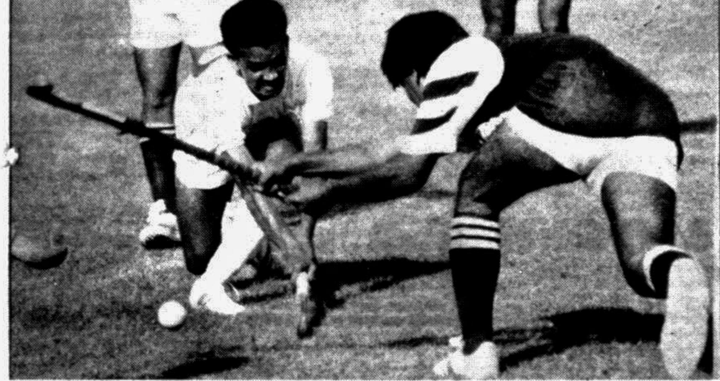
The BKSP and the Mymensingh DSA stickwinders clash for control of the ball in yesterday's inaugural match of the national hockey championship at the Hockey Stadium. BKSP won 5-1.

Participating teams are: Group 'A': BKSP, Bangladesh Army, Faridpur, Chittagong DSA, Dhaka Education Board, Narayanganj, Bangladesh Railway, Bangladesh Police, Patuakhali, Bogra and Munshiganj DSA.