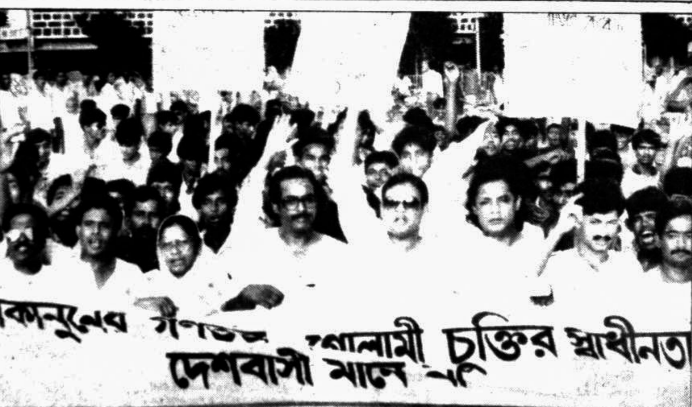
Jatiya Ganatantrik Party (JAGPA) brought out a procession in city on Friday demanding repeal of all black laws.

Turning to the emergence of a new democratic process, the Minister said that the two major political parties that spearheaded the pro-democracy movement in the country were led by women. These women leaders, he said, have once again created history by joining their hands for establishing parliamentary democracy through the unanimous adoption of the 12th Constitutional Amendment Bill, 1991.