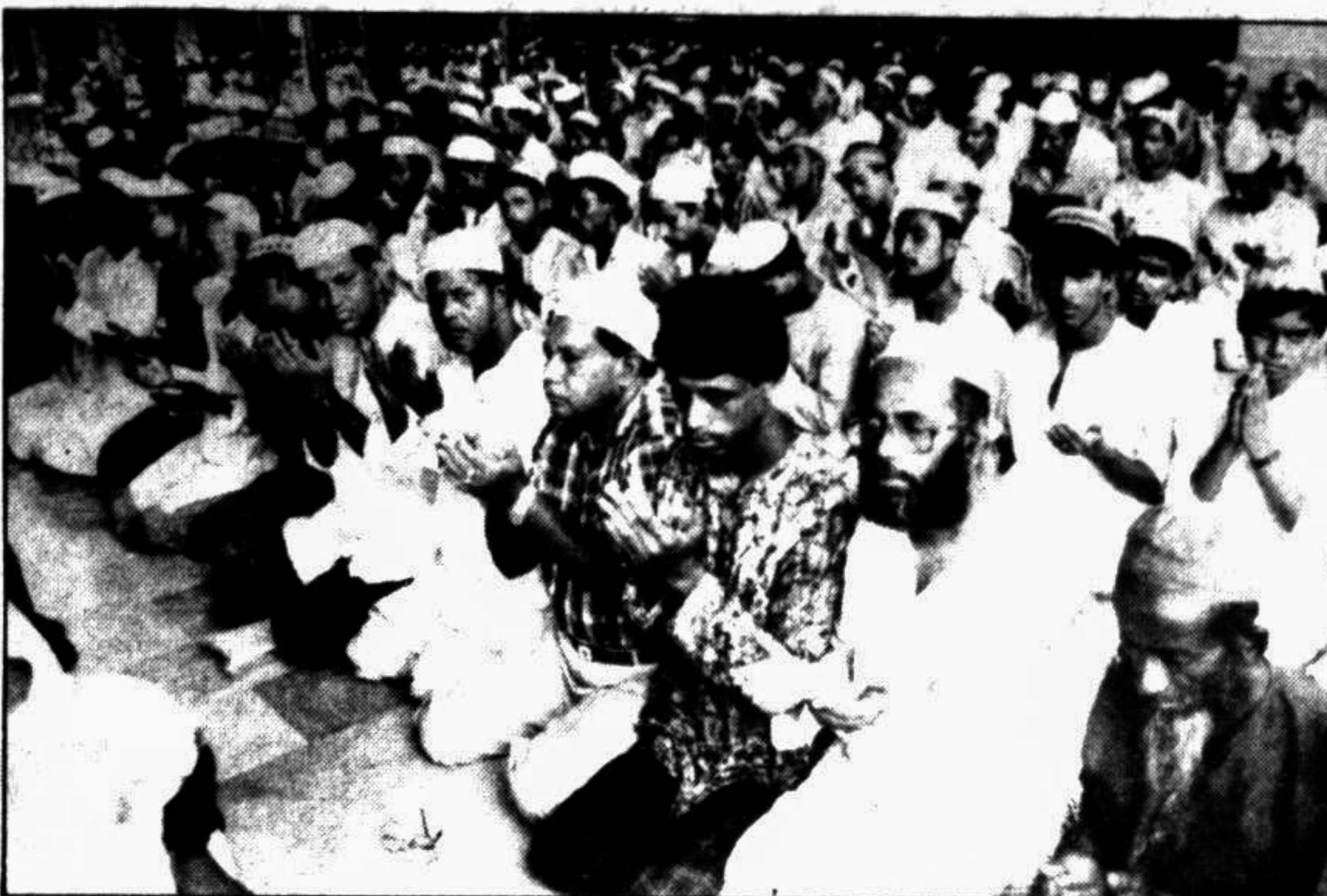
Special prayers were offered Friday throughout the country for sustained parliamentary democracy. The special prayers were held at mosques, mandirs and other religious holy places in the city and other parts of the country. At the Baitul Mukarram national mosque, in Dhaka, the special prayer was offered after the Jumma prayer.