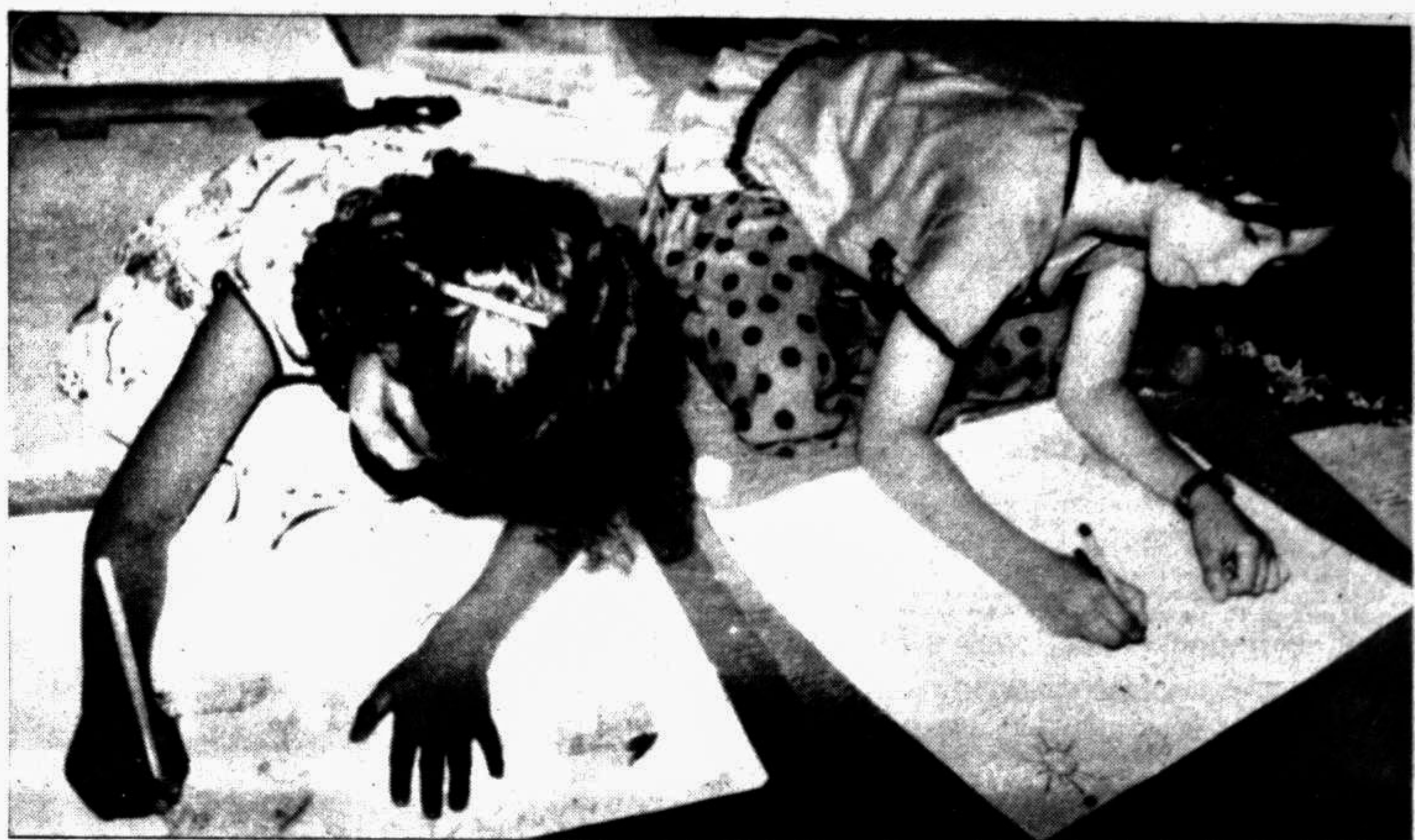
DEVELOPING A PASSION FOR ART: Children participating in a painting competition in the city yesterday.

The Finance Minister said See Page 12 Col. 3