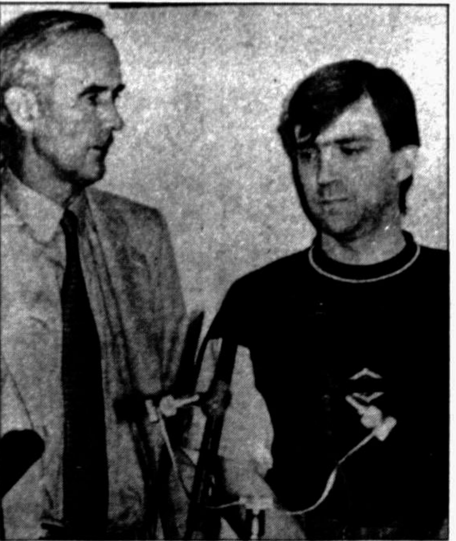
Freed British hostage John McCarthy (R) pauses during his press conference at the Syrian foreign minister's office. McCarthy arrived at Royal Air Force base at Lyneham, southern England on Thursday.