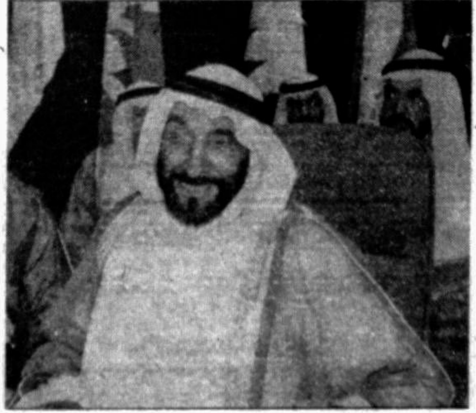
Sheikh Zayed became ruler of Abu Dhabi on August 6, 1966, replacing his brother Sheikh Shakhboub, whom the family found unfit to rule. Sheikh Shakhboub died two years ago.

Money also played a major role in keeping together Abu Dhabi and its six partners in the United Arab Emirates (UAE), of which Sheikh Zayed has been President since it was created in 1971.