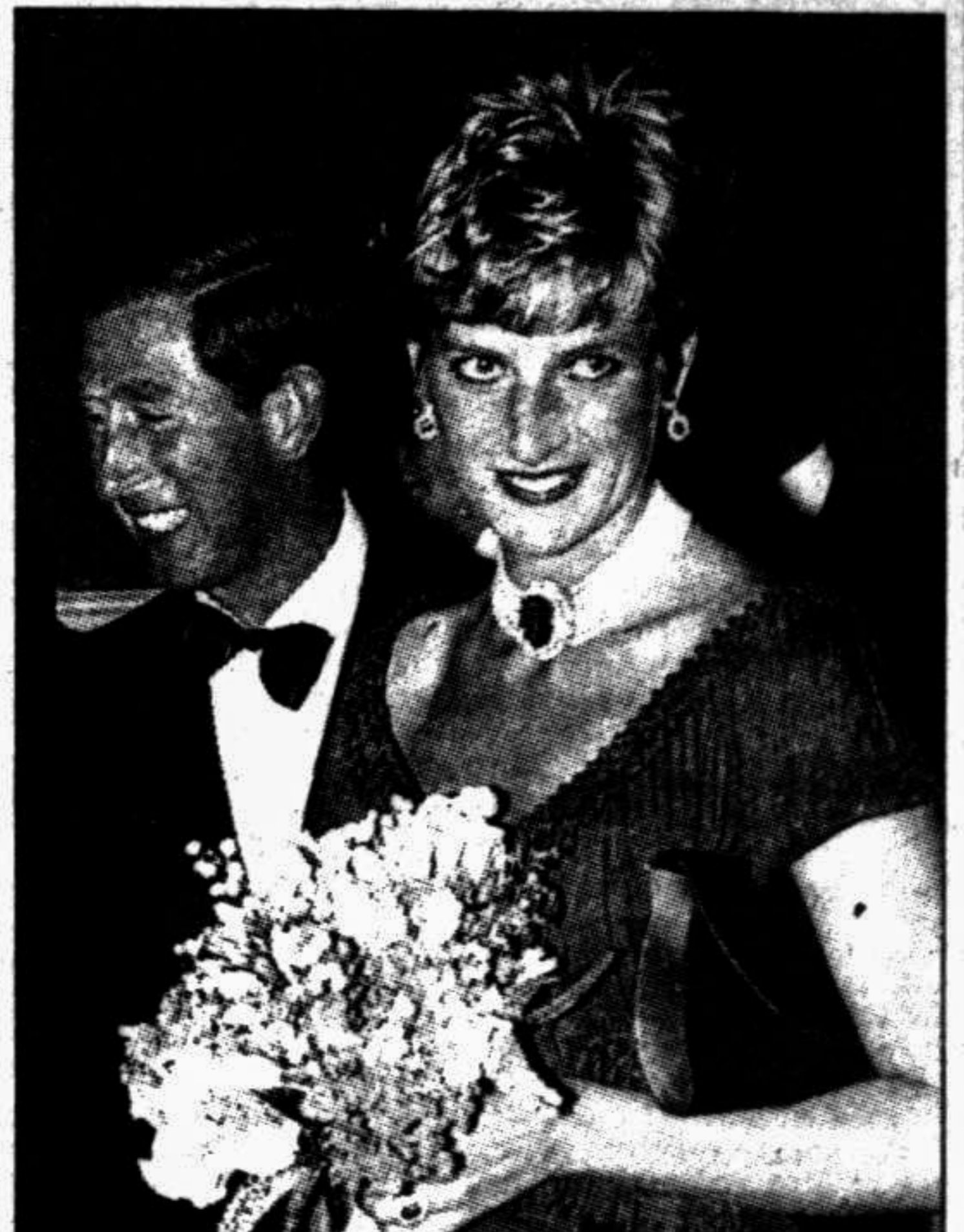
Charles, Di on a second 'honeymoon'

Muscles from Brussels LOS ANGELES: Actor Jean-Claude Van Damme, the so-called "Muscles from Brussels" and champ of martial arts movies, hopes his new offering will help kick his beefcake image and show audiences he can act, reports AP.