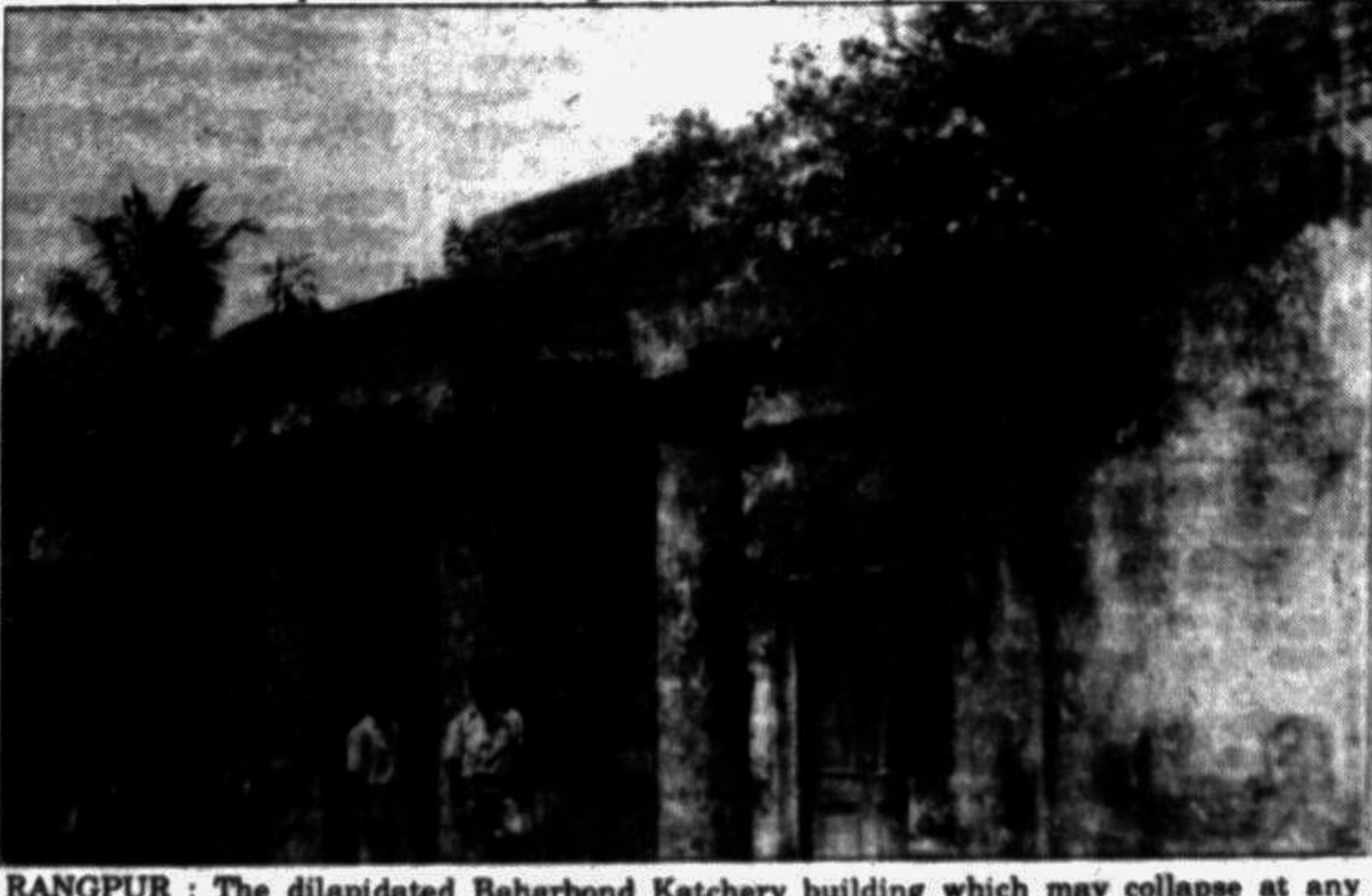
RANGPUR: The dilapidated Baharbond Kutchery building which may collapse at any moment.

Recently formed Chuadanga Government College Sangrami Chhatra Samaj ransacked the office of the Principal and damaged the office furniture on July 30 for not publishing a white paper on account of the college students union of 1988-89. The Sangrami Chhatra Samaj had been demanding the white paper and submitted memorandum to the college authority.