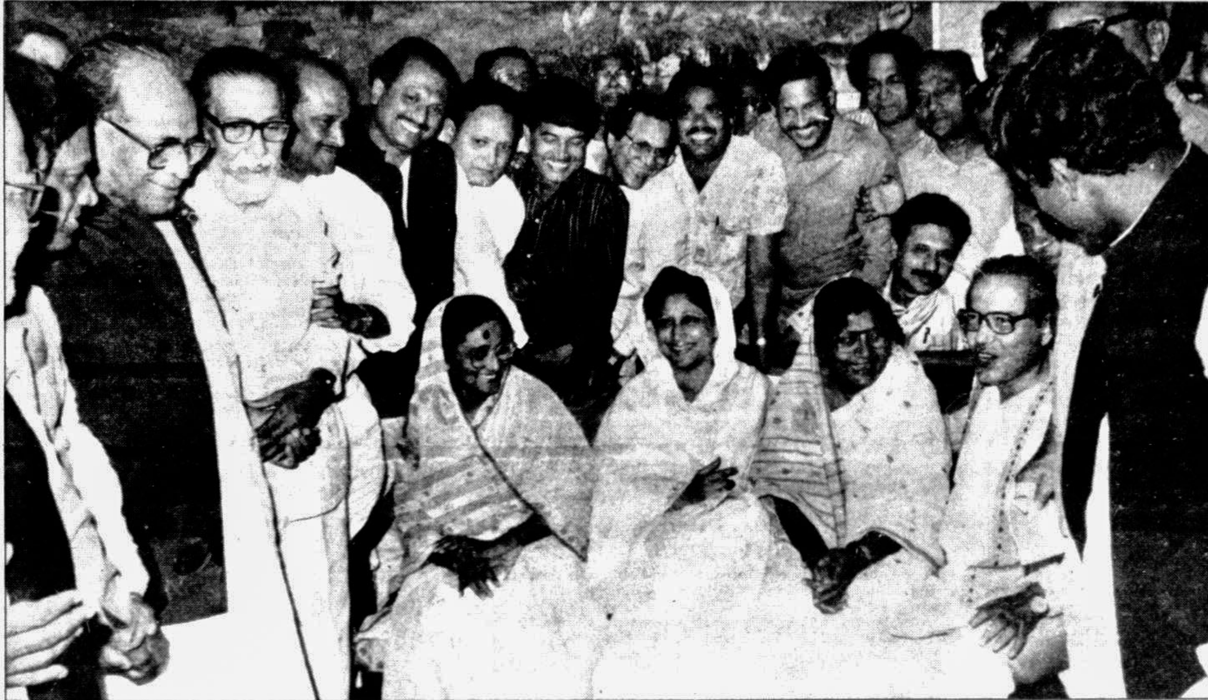
MAKING HISTORY: Prime Minister Begum Khaleda Zia and Opposition Leader Sheikh Hasina with other leading members of parliament in the Sangsad Bhavan moments before the passage of the two Constitution amendment bills on Tuesday night.

be organised soon. The Constitution 11th and 12th Amendment Bills owe their origin to the November 19 joint declaration of the eight, seven, and five party alliance which called for establishment of parliamentary democracy. It was on the basis of the joint declaration that the government of H M Ershad in the face of a mass upsurge handed over power to a person (Chief Justice Shahabuddin Ahmed) nominated by the three alliances to form a caretaker government to hold elections of sovereign Parliament. The elections held on February 27 created the present parliament. The Constitution 11th and 12th Amendment Bills were introduced in the Parliament by Law Minister Mirza Golam Hafiz and Prime Minister Begum Khaleda Zia on July 2. Abdus Samad Azad of AL introduced another comprehensive bill, and Workers Party member Rashed Khan Menon moved four single-clause bills on July 4. These seven Constitution Amendment Bills were scrutinised by a 15-member Parliamentary Select Committee headed by Law Minister Mirza Golam Hafiz. The committee submitted an unanimous report to the House along with the 11th and 12th Constitution Amendment Bills as modified by it on July 28. See Page 12 Col. 1