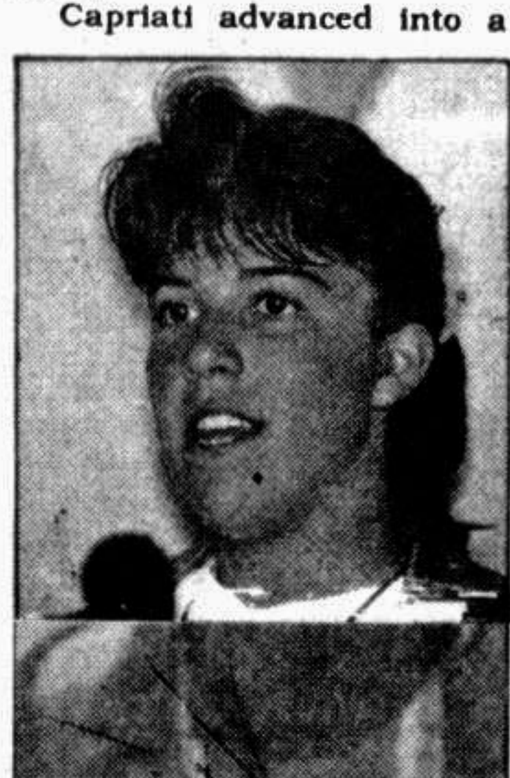
JENNIFER CAPRIATI quarterfinal match against fifth-seeded Zina Garrison...