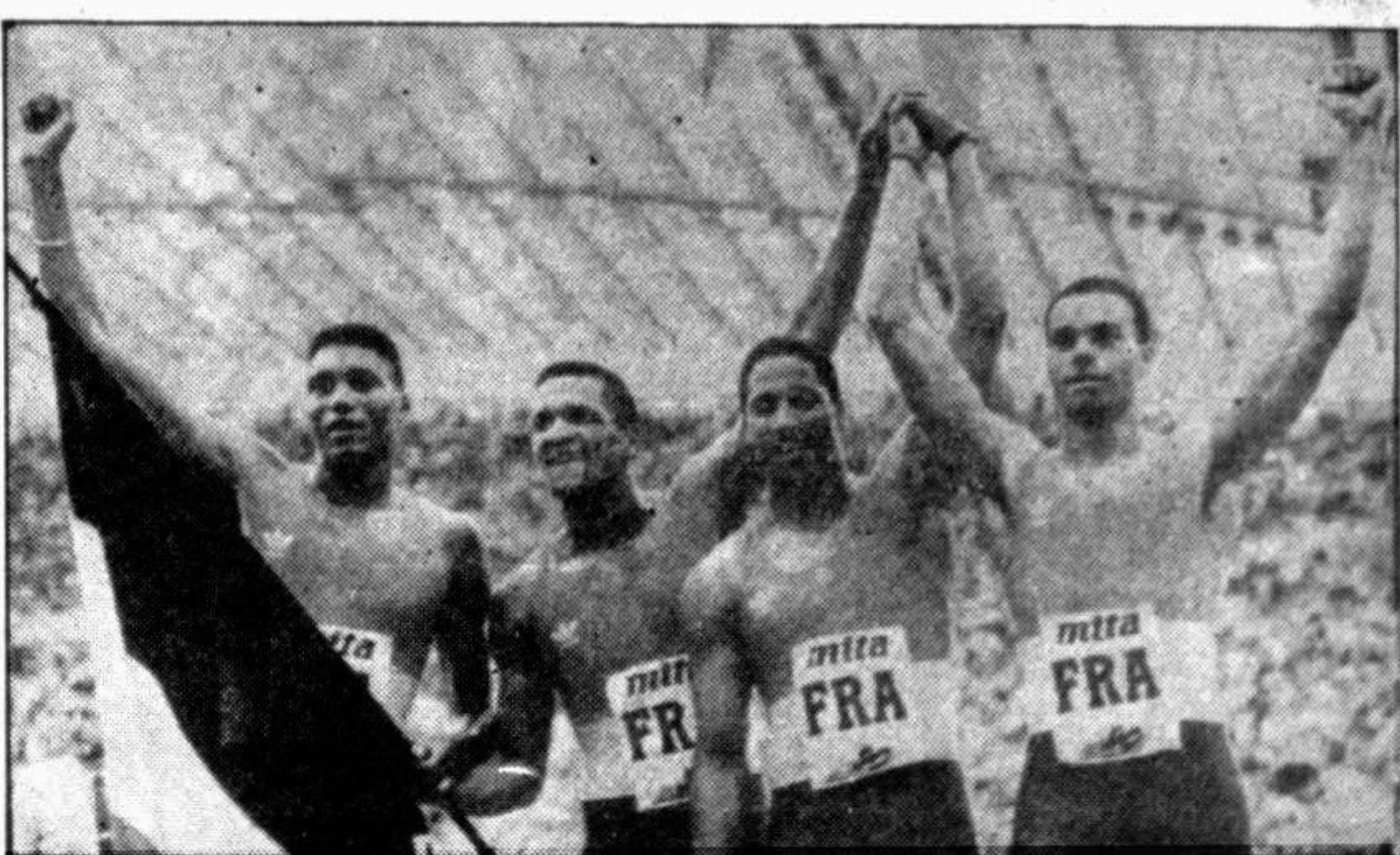
The French men's 100 m relay quartet which set the world record in Split, Yugoslavia last year.

The women's 200 metres features Jamaican Merlene Ottey, the world number one for the past two years, her compatriot and Olympic silver medalist Grace Jackson and Germany's 1986 European champion Helke Drechsler.