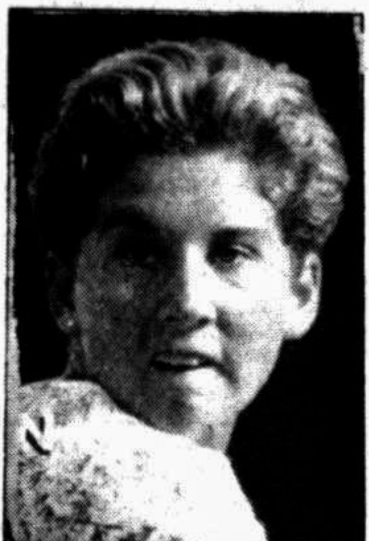
MONICA SELES face the winner of Friday's match between third-seeded Manuella Maleeva-Fragniere...