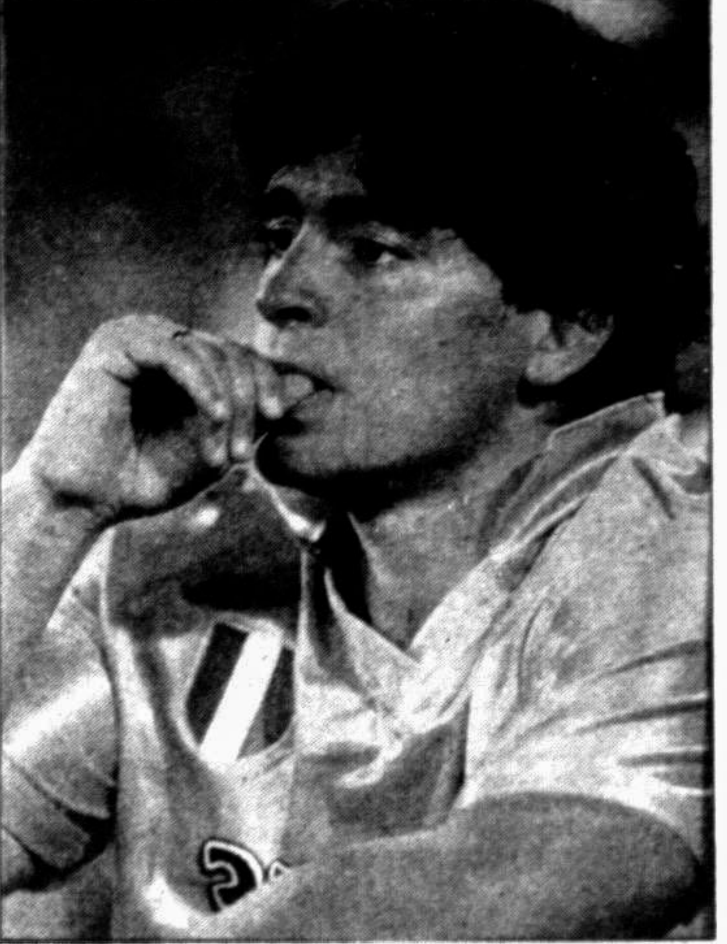
DIEGO MARADONA...no more professional play

BUENOS AIRES, Aug 2: A bitter Diego Maradona, banned from soccer until July 1992 for failing a dope test, said on Thursday he will not return to the professional game, reports Reuter.