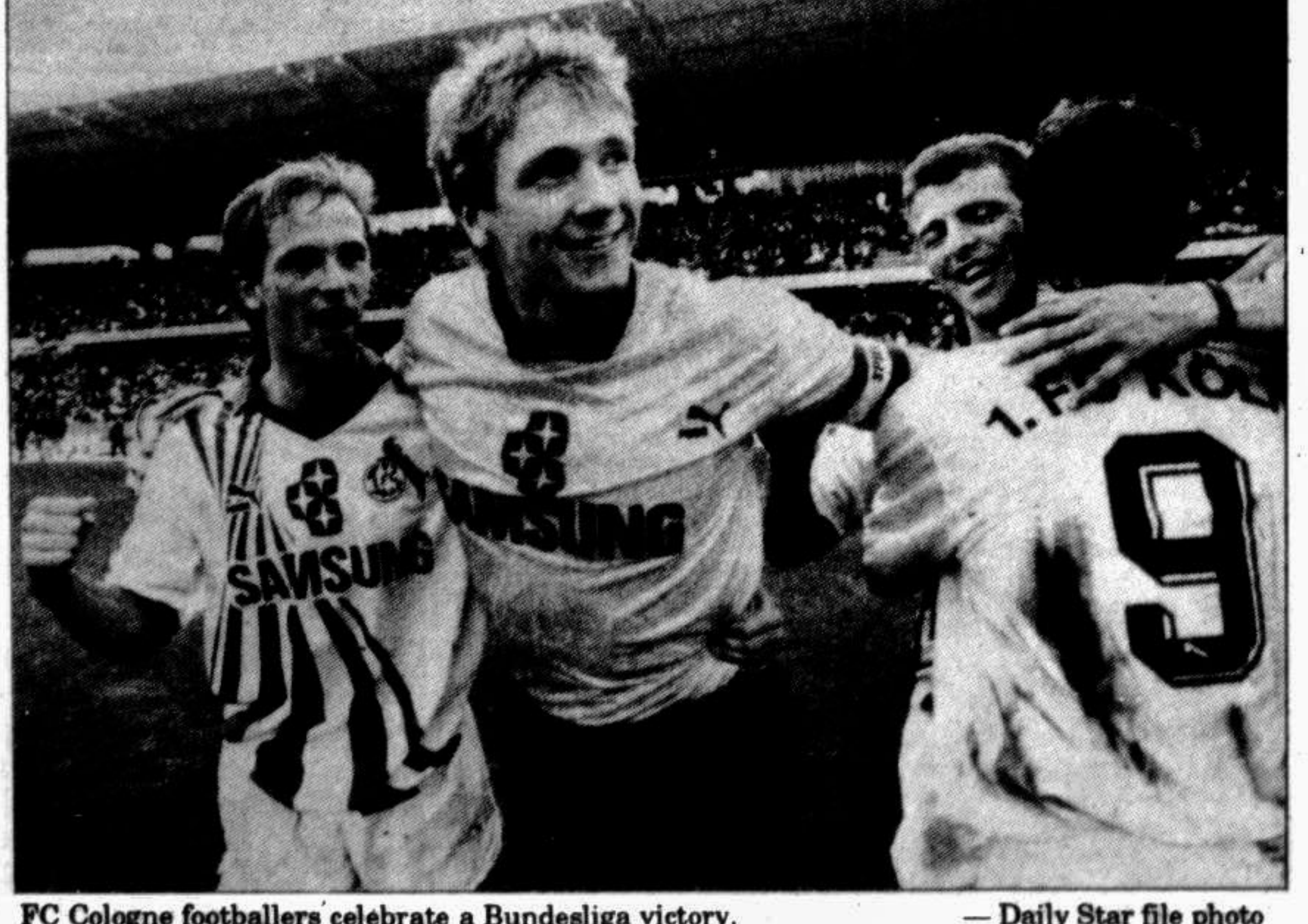
FC Cologne footballers celebrate a Bundesliga victory.

Augenthaler's replacement in the national side, Thomas Berthold, has returned from Italy to boost the Bavarians' defence. Kaiserslautern striker Bruno Labbadia and Brazilian international midfielder Bernardo have also signed. Coach Jupp Heynckes spent much of last season signing his team's praises, only to be embarrassed by the outcomes of the title race. He has decided to rest his voice more this season. "We are not going to talk so much," Heynckes said. "We will be more reserved about our aims and then perhaps we can get back to the successes of the season before last."