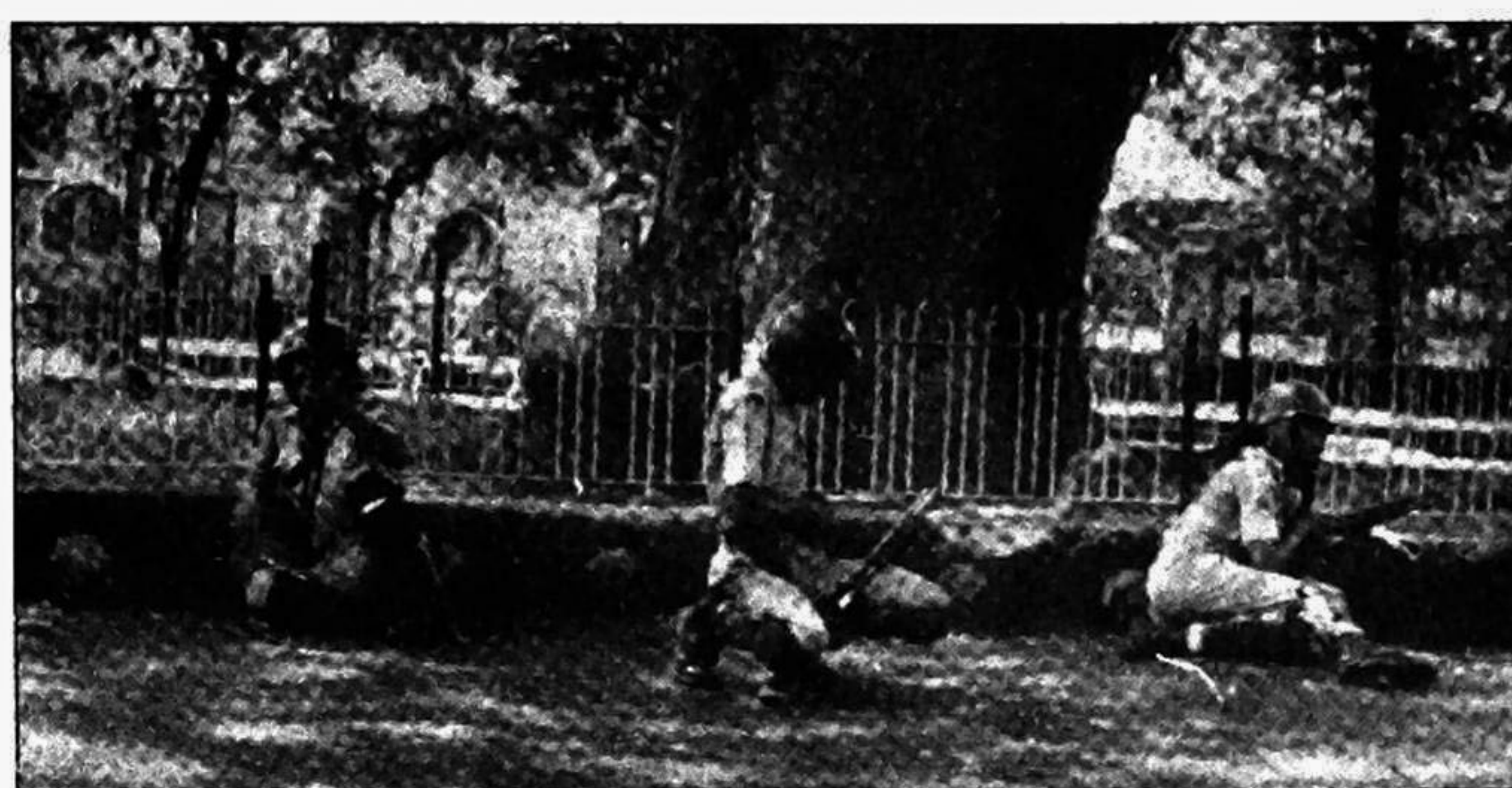
Law enforcing personnel with their guns maintaining a safe distance; above and bottom: A motor cycle set ablaze on the Dhaka University campus Thursday.

From Page 1 Col. 8 The followers of Bangabandhu Sheikh Mujibur Rahman to work unitedly under the banner of Awami League and complete unfinished task of the father of the nation.