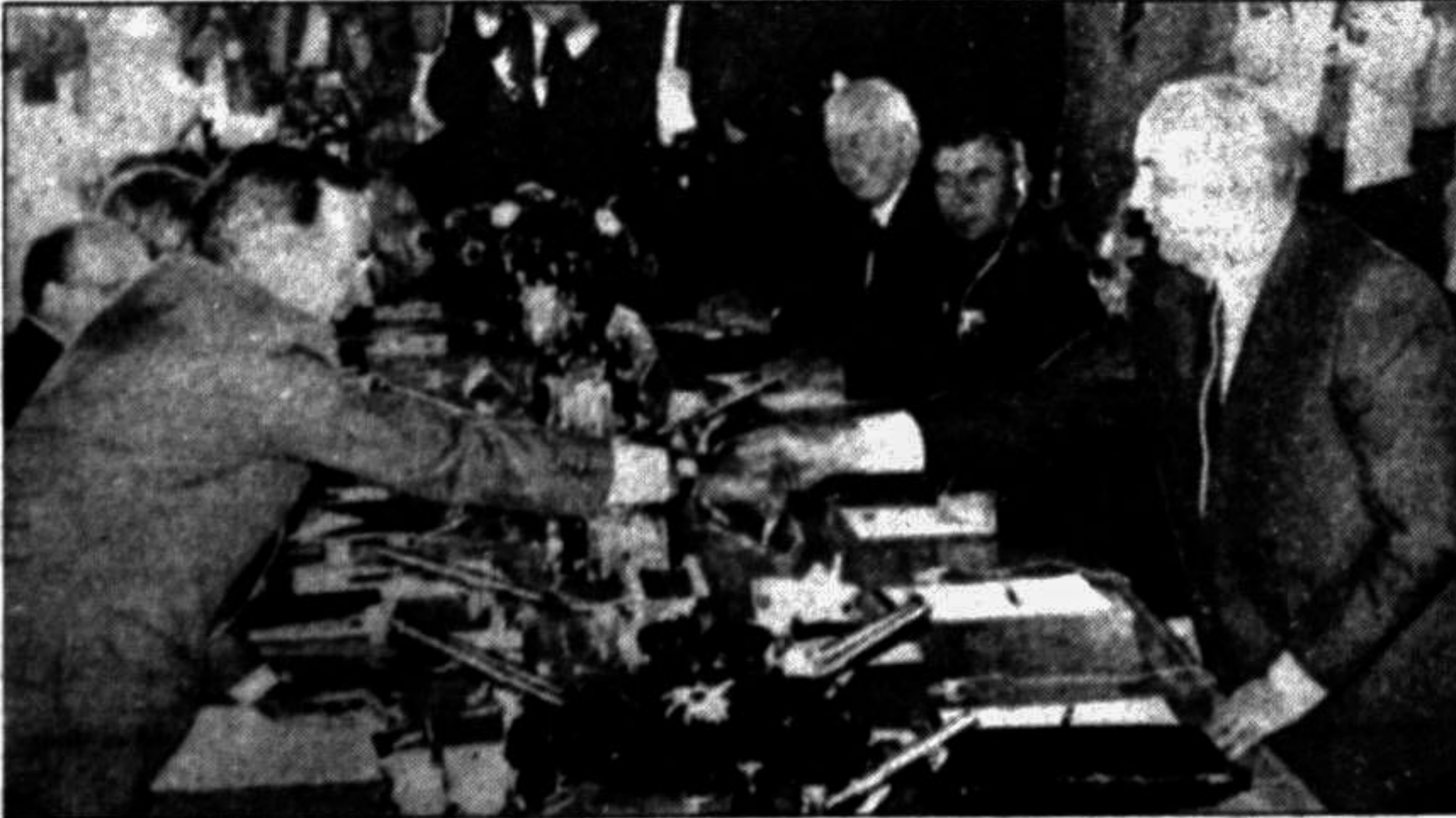
US President George Bush (L) smiles as he shakes hands with his Soviet counterpart Mikhail Gorbachev at the start of their first round talks at the Kremlin St Katherine's Hall on Tuesday.

Star Report MOSCOW, July 30 : US President George Bush opened a superpower summit with Mikhail Gorbachev on Tuesday by proclaiming "an end to a long era as adversaries" and awarding the Soviet Union the long-sought economic prize of most-favoured-nation trade status, reports agencies. Bush said the lowering of tensions between the two nations have "made it possible for our two nations to normalise economic relations". He promised to send to the United States Congress a US-Soviet trade agreement that will give Moscow many of the trade benefits enjoyed by America's closest allies. The two leaders on Wednesday will sign the Strategic Arms Reduction Treaty, the first accord of the nuclear age to actually reduce nuclear arsenals. Bush called it "another step away from the See Page 10 Col. 6