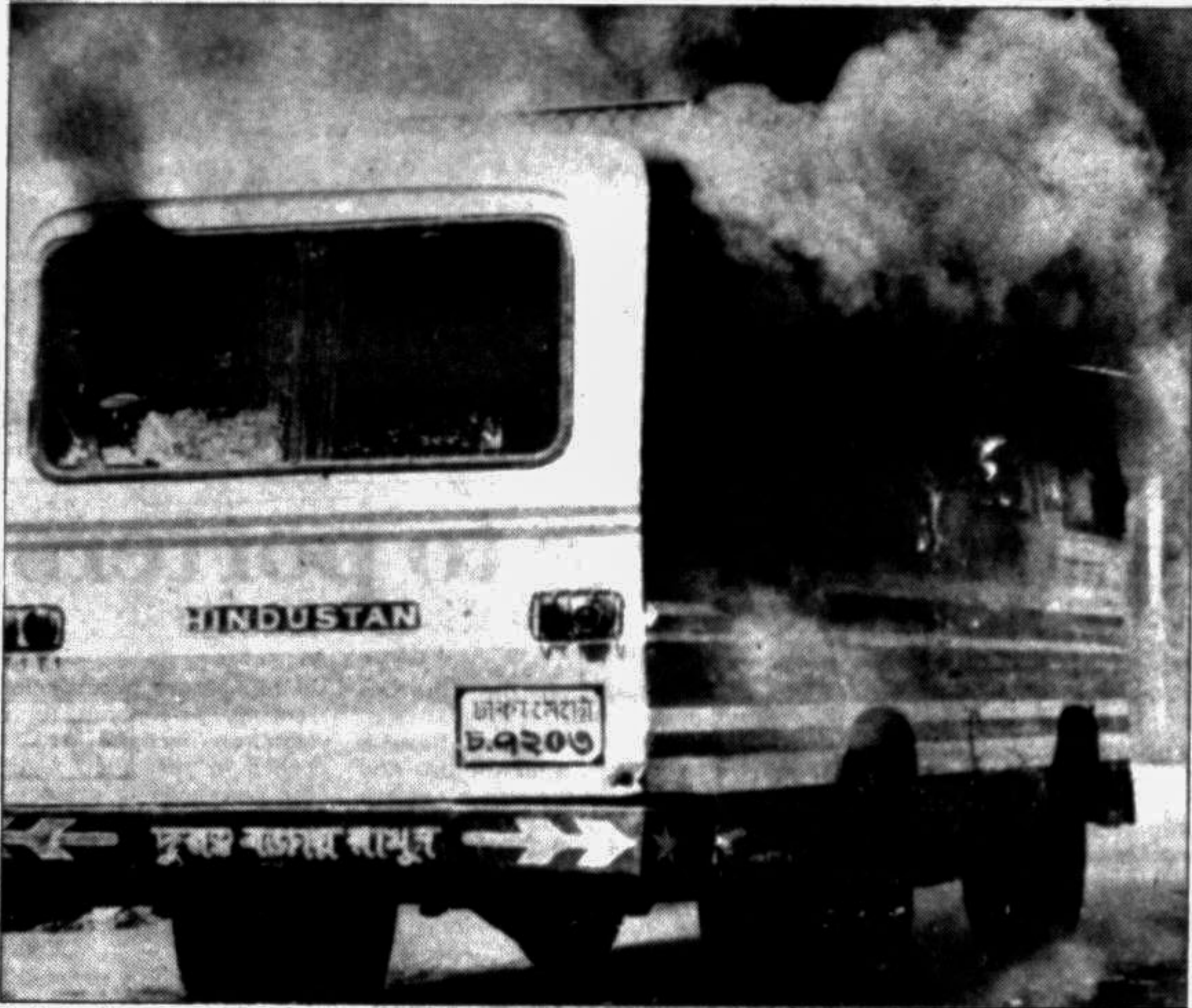
Agitated transport workers set fire to a bus Saturday at Hathkholia in the city. Story on Page 1.