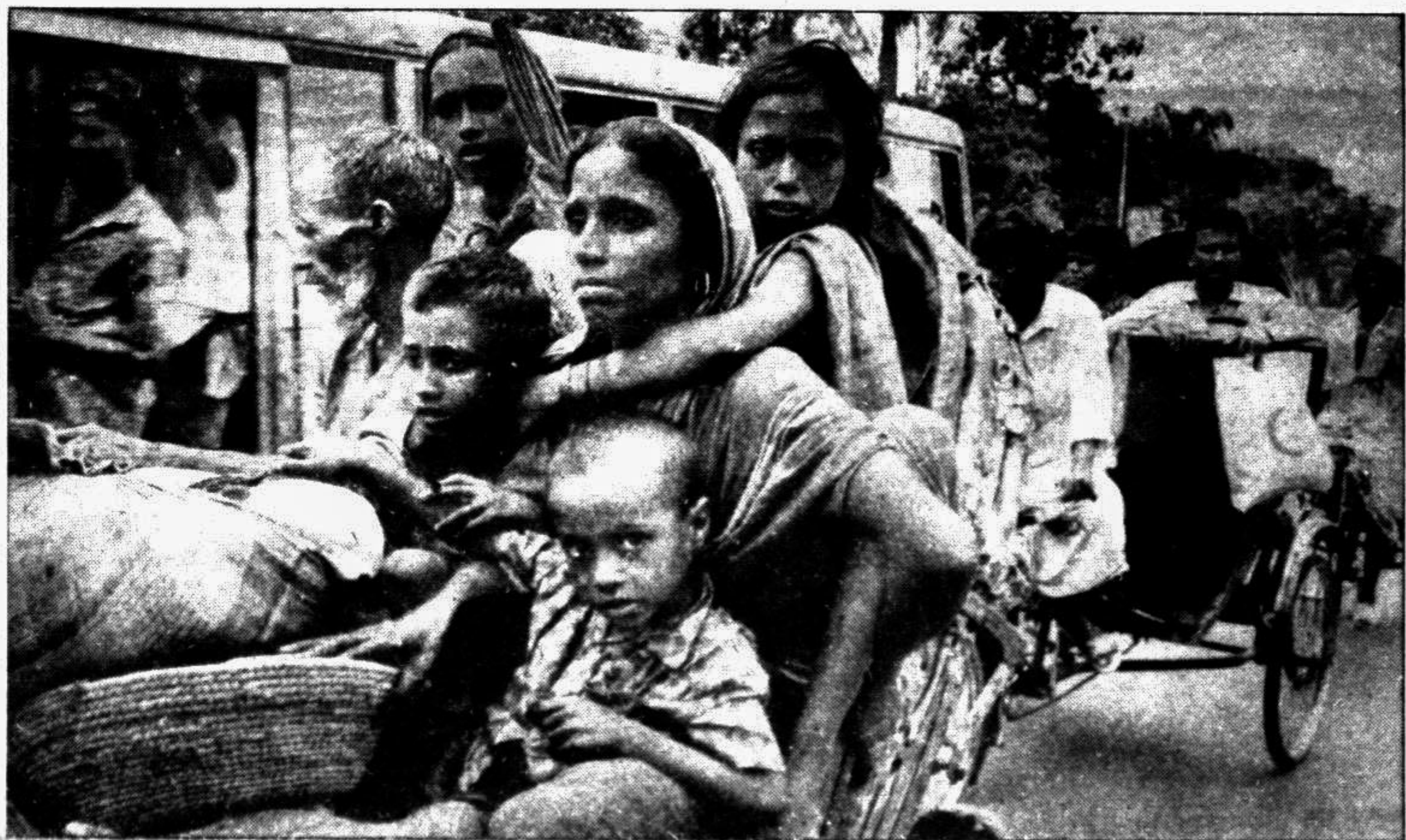
IN SEARCH OF A ROSY FUTURE: A rural family rides a rickshaw in the bustling streets of the capital in search of a new home, most likely in a slum, to begin the struggle for survival anew.

project which, experts claim, was not needed at least before 1995. The accident occurred as a 'carbon dioxide stripper' gave in to gas pressure, leaving 11 dead and 27 others injured. Loss in terms of equipment, production, and compensation for the deaths was estimated at Taka 25 crore. A new production process called 'Advanced Cost and Energy Saving' (ACES) which was to be installed under the project has been postponed for