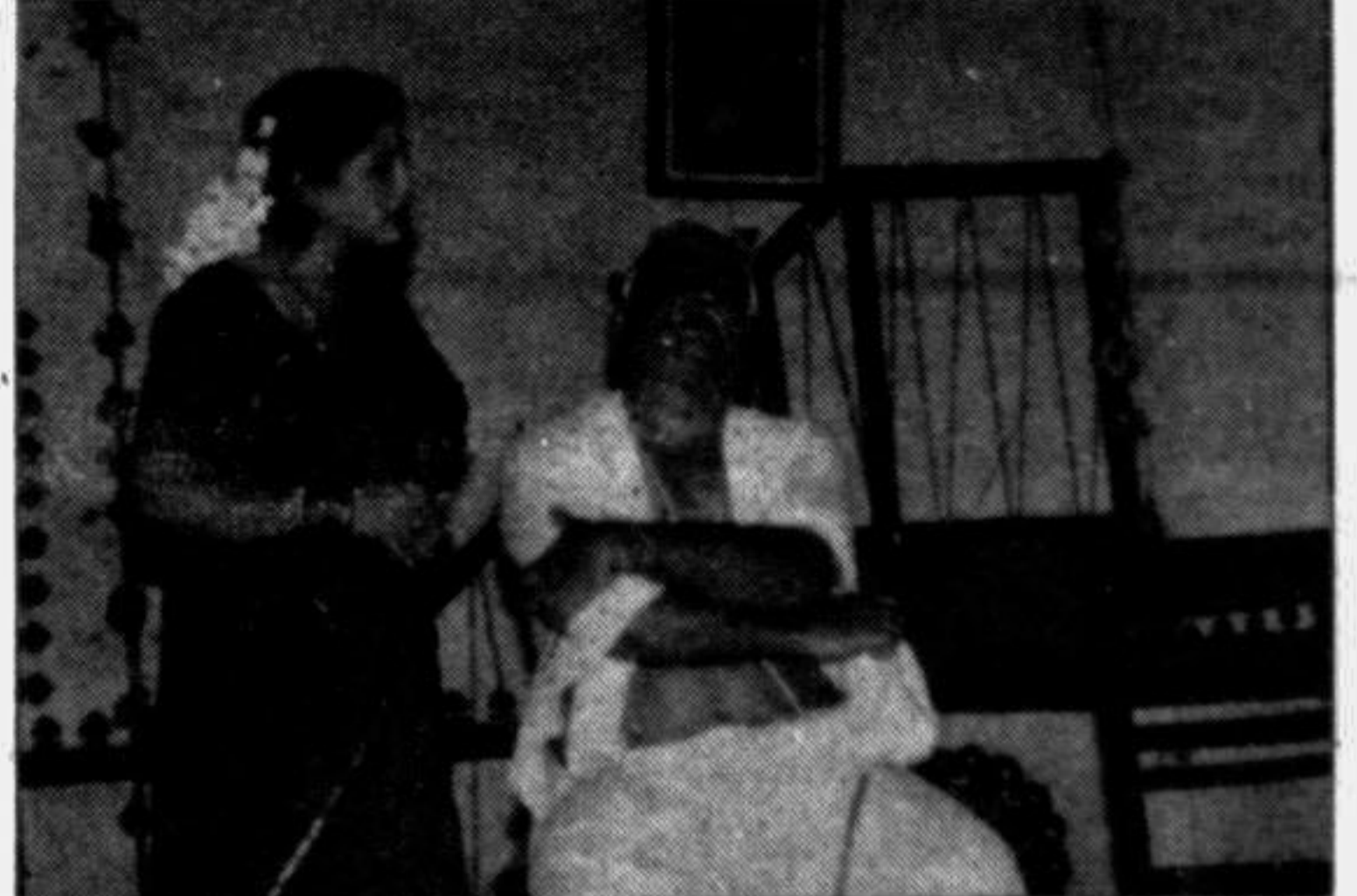
RANGPUR: A scene of a drama Nahabat staged at Town Hall by Shikha Sangsad recently.

Meanwhile, law enforcing agencies of the district seized smuggled goods worth Taka 45 lakh last month.