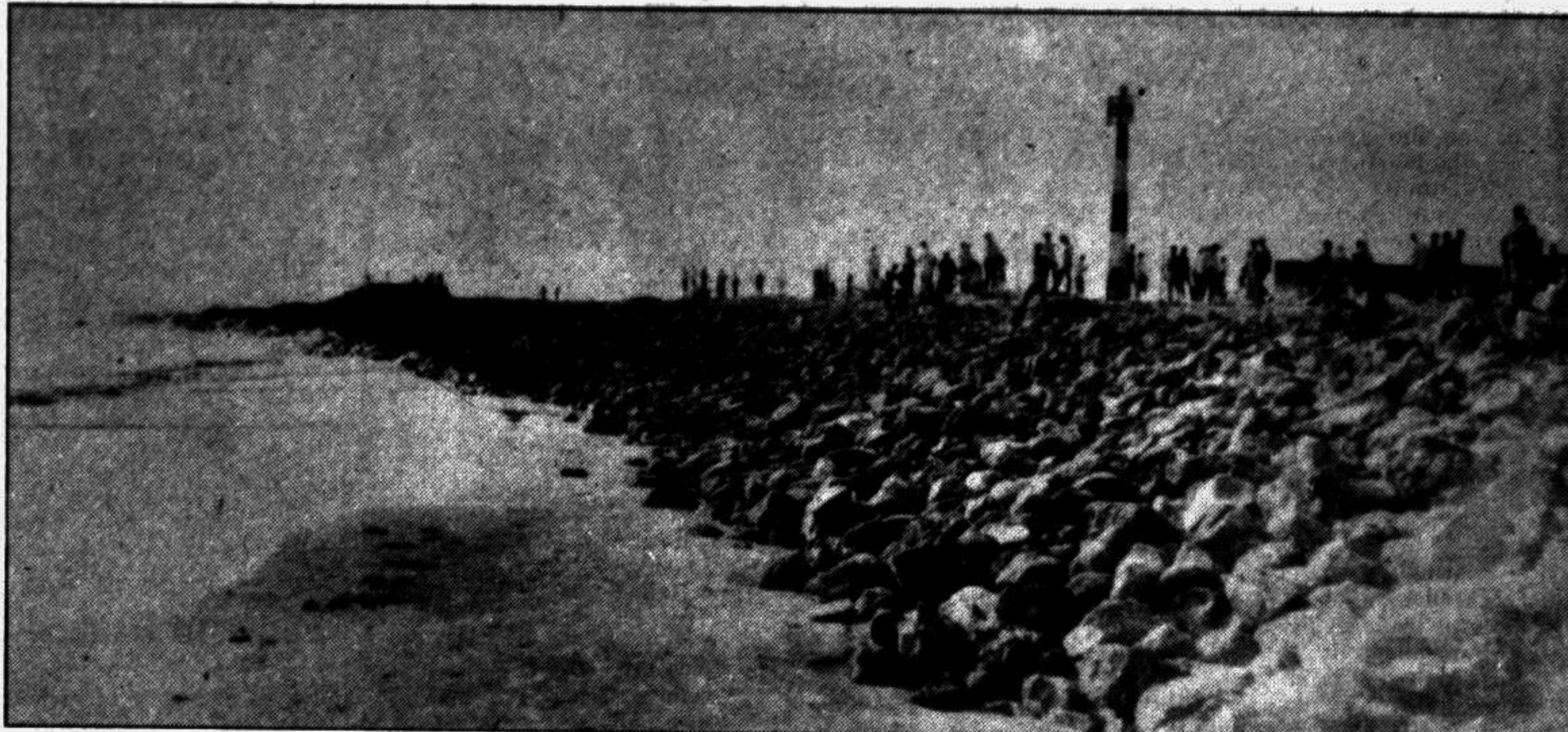
THE BAY STILL BECKONS: Hundreds of people still come to stroll along the beach and on parts of the battered embankment at Patenga, that stand testimony to the might of the massive wave that claimed thousands of lives.