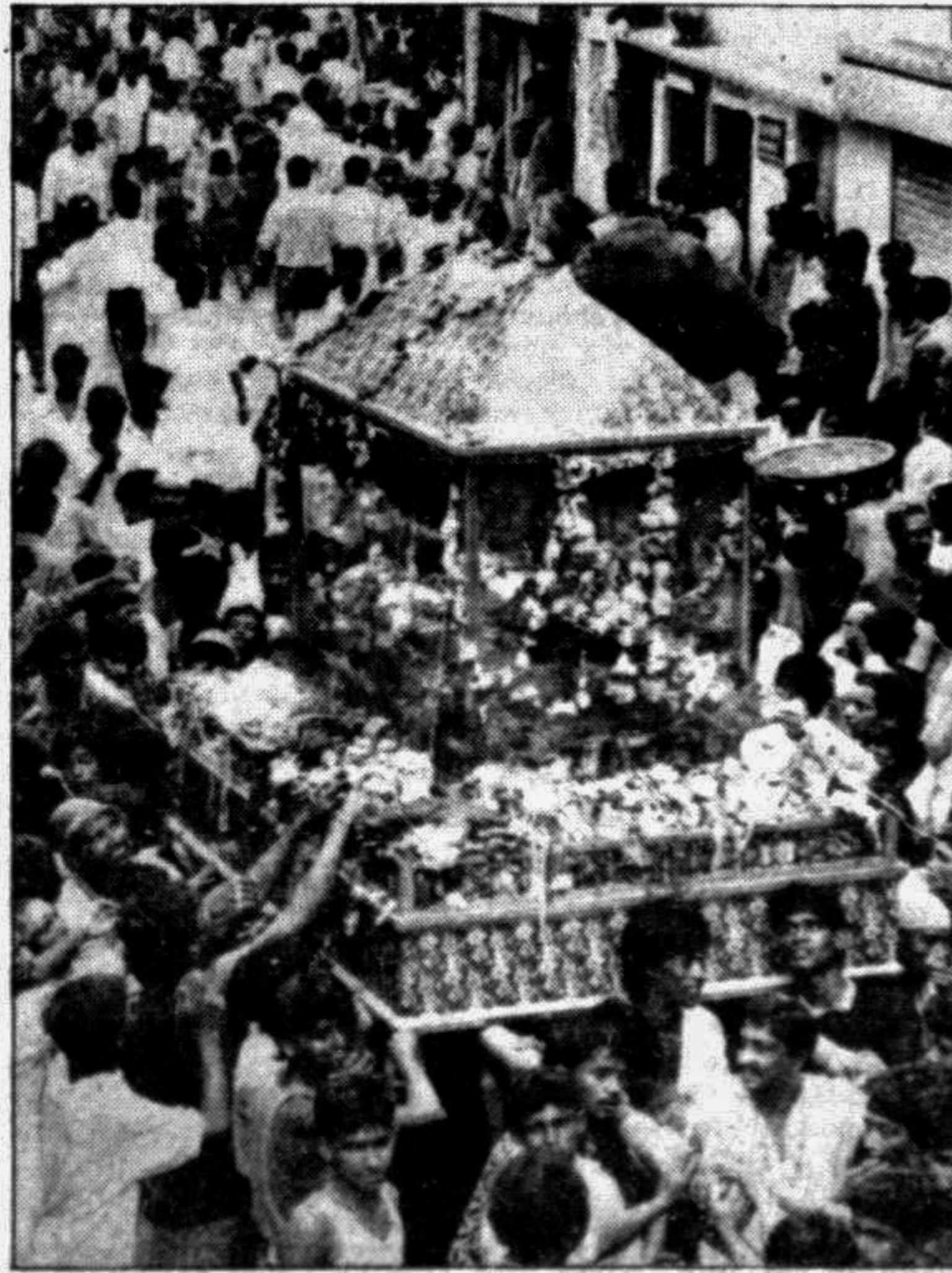
A Tazia procession in the city on the occasion of Ashura Tuesday.