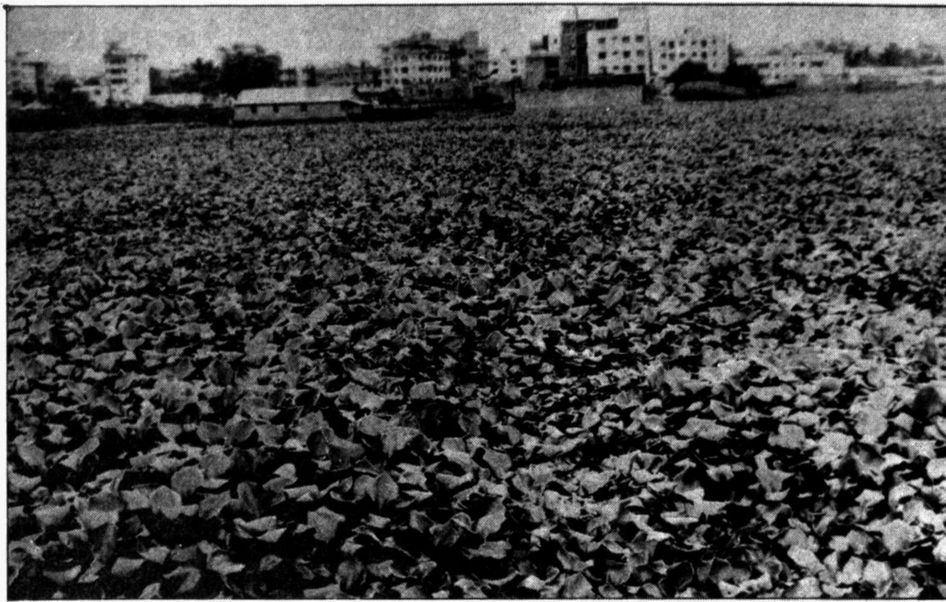
Mosquito menace has assumed an alarming proportion in urban as well as rural areas. Stagnant water in uncleaned drains and ponds filled with water hyacinth are the ideal mosquito breeding centres. Photo shows a derelict pond filled with hyacinth at a place in Narayanganj.