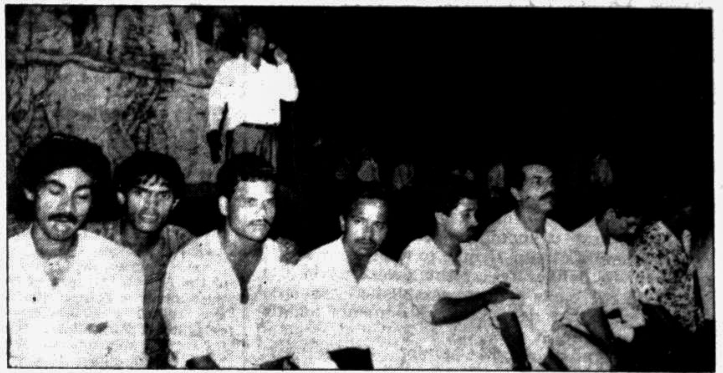
Jatiyatadabi Chhatra Dal (JCD) at a rally on DU campus Friday called for resisting any bid to foil forthcoming DUCSU and hall unions polls.

These items were brought from Singapore on false declaration.