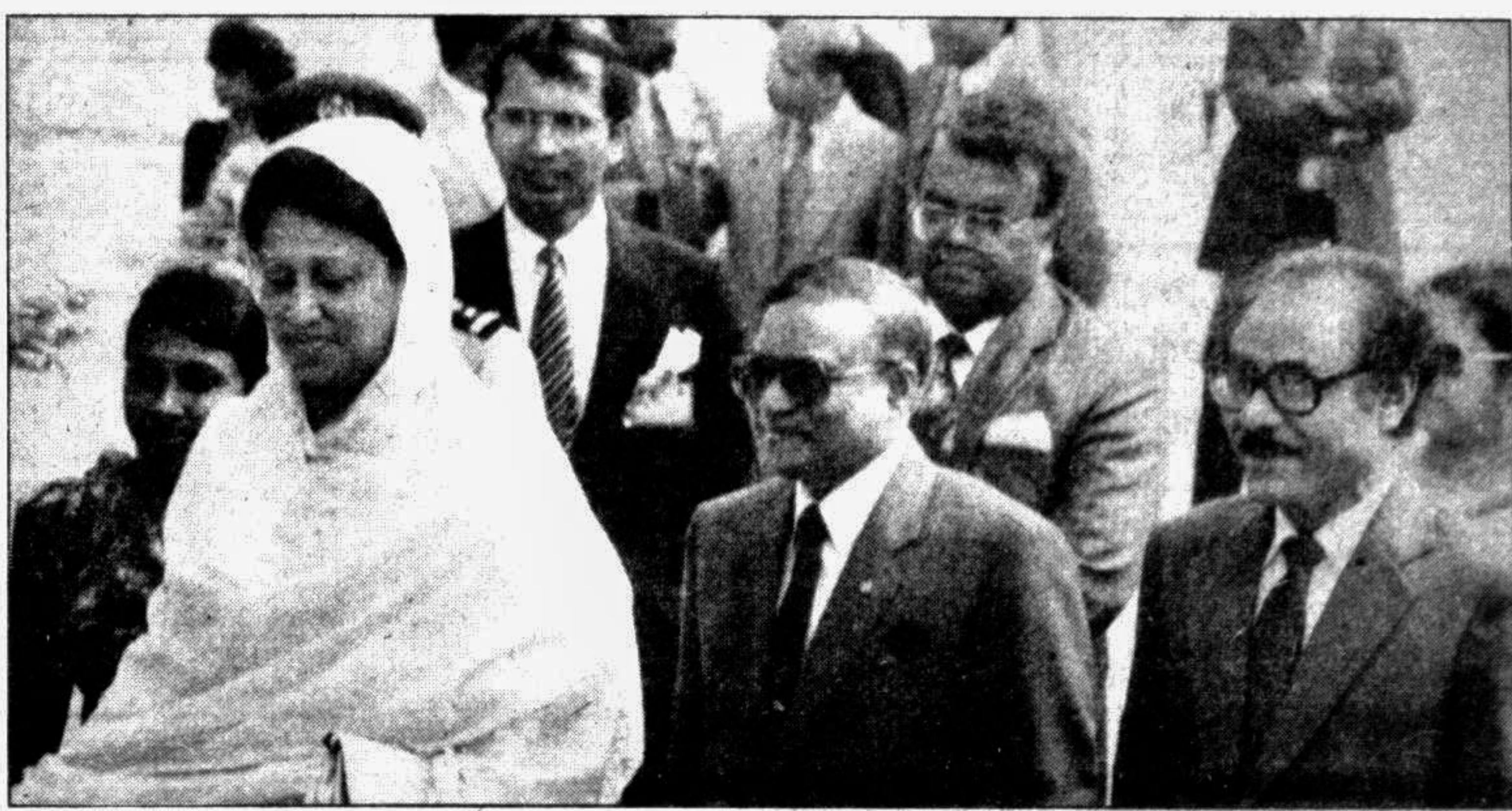
Maldivian President Maumoon Abdul Gayoom being received by Acting President Justice Shahabuddin Ahmed and Prime Minister Begum Khaleda Zia at the Zia International Airport Friday.