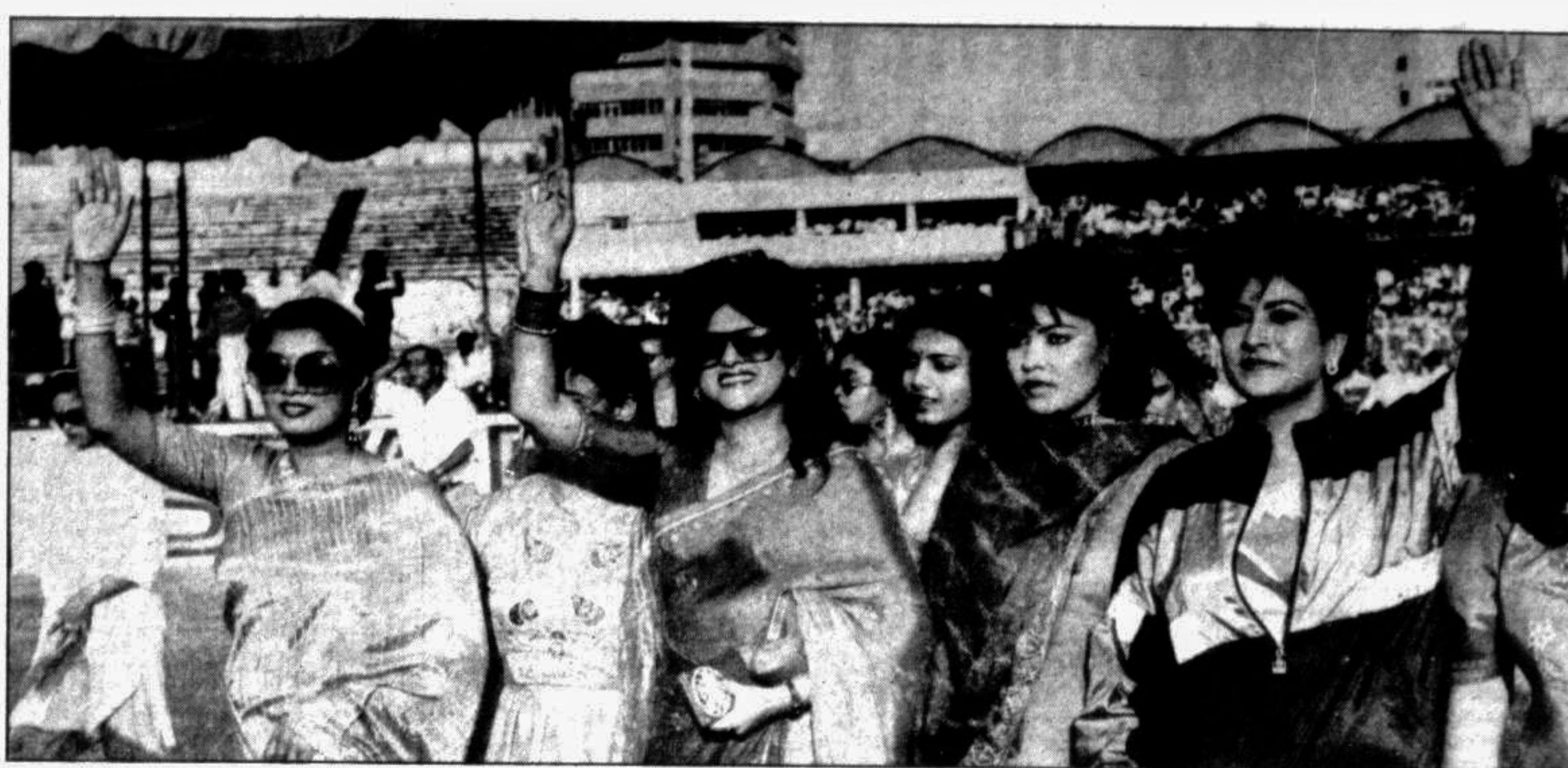
Super novas of Dhaka film Babita and Champa along with fellow stars waving to the enthusiastic spectators just before kick-off of yesterday's charity bazaar at Dhaka Stadium.

The BFF also announced the budget of the tournament which will be of Taka 44 lakh.