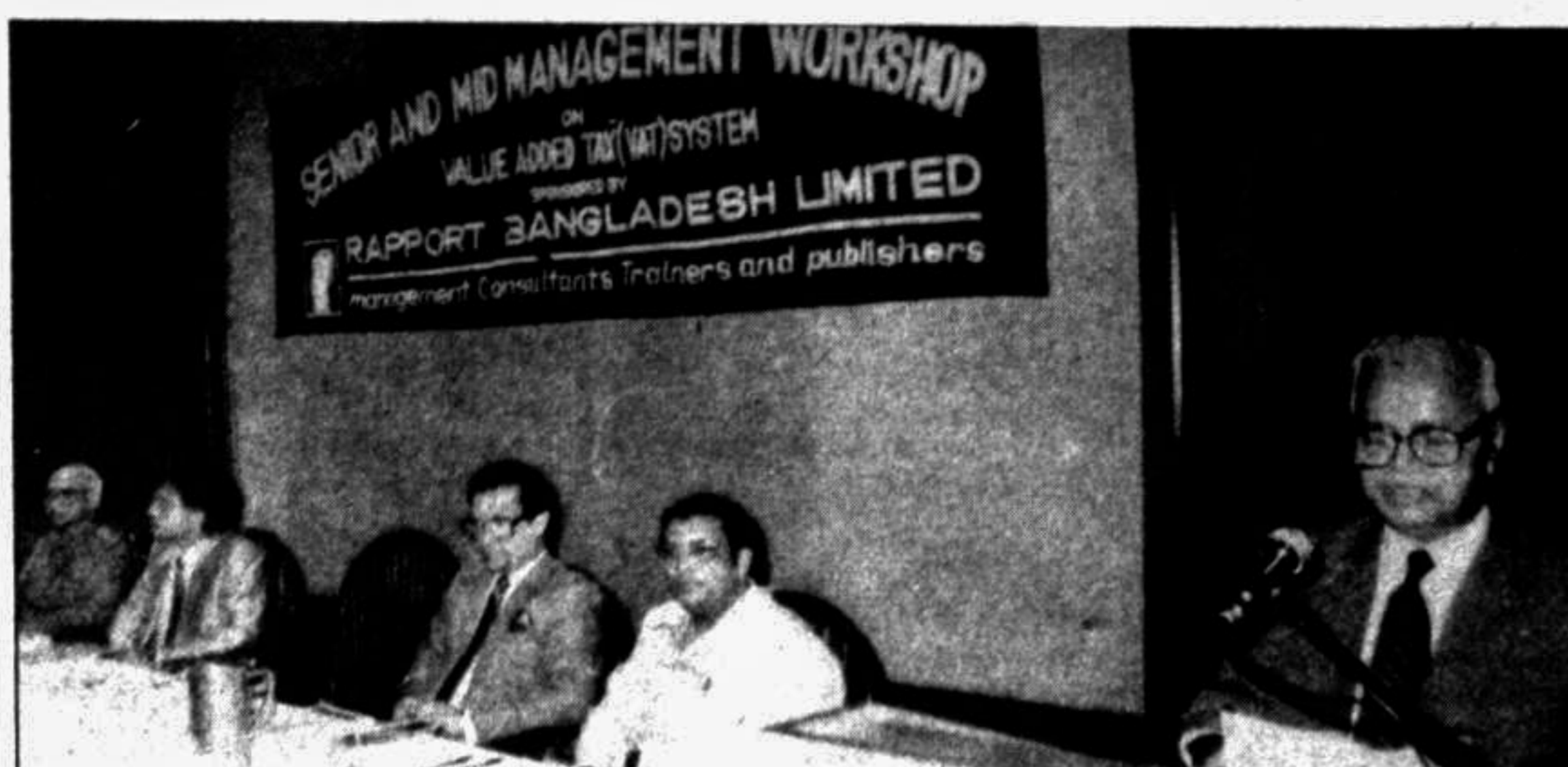
Speaker Abdur Rahman Biswas speaking at a workshop on Value Added Tax (VAT) system organised by Rapport Bangladesh Limited at Hotel Sonargaon in the city on Friday.