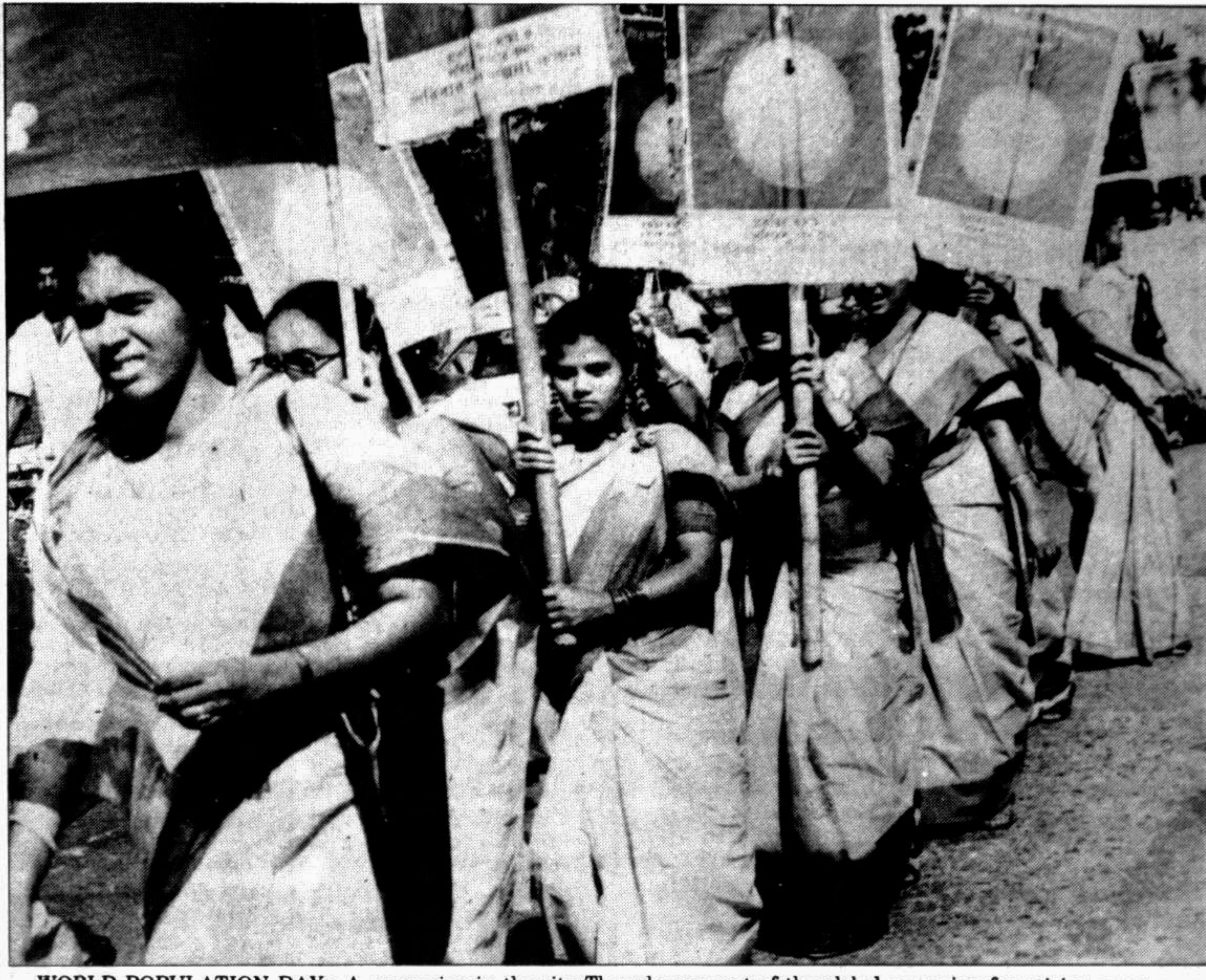
WORLD POPULATION DAY : A procession in the city Thursday as part of the global campaign for raising awareness about matching the growth of population with the pace of development and natural environment.

Star Report Khaleda Zia has initiated a dialogue with political leaders, Syndicate members of the universities and other professional leaders to bring back an academic atmosphere in the country. The Prime Minister has convened a meeting of the political leaders today at 4 pm at the International Conference Centre to discuss all these issues. The Education Ministry is reportedly drafting a bill proposing steps to punish the armed terrorists in the educational institutions and to flush out outsiders from the university halls. The Education Ministry is also considering new steps to stop unfair means in the examinations. A law may be enacted providing for exemplary punishment to students who adopt unfair means in the examinations. The photographs of the students may be published in the newspapers to expose them publicly. If any invigilator helps a student in adopting unfair means, strict action may be proposed against that teacher along with the suspension of grant for that school. The students who adopt unfair means may be disqualified from pursuing their studies for a few years. Prime Minister Begum