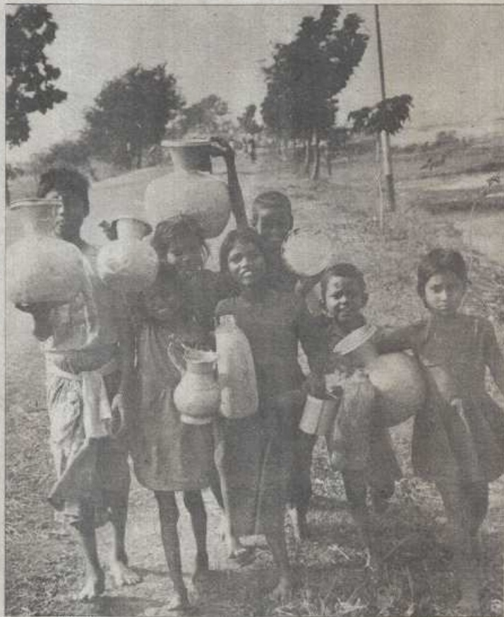
Scarcity of drinking water persists mostly in rural areas due to shortage of tubewells. Photo shows children set out for procuring drinking water at a village in Noakhali.

Three other members of the society will be nominated by the President later.