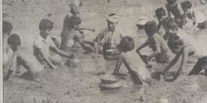
Rural children find it fun and frolic in catching fish from a pumped out pond at a village in Rangpur.

Both the parties brought out processions to protest the Dhaka Jagannath College incident and at one stage clashes ensued. Two handbombs were hurled, injuring five persons. Tension is prevailing in the Kaliganj area.