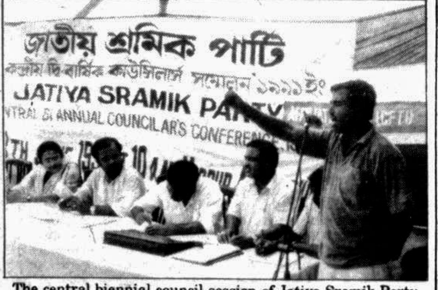
The central biennial council session of Jatiya Sramik Party was held at Mirpur recently.

Referring to the role of parents she said due to the big family size in Bangladesh, they have an added responsibility to oversee what their children are doing. She proposed that parent teachers association can also