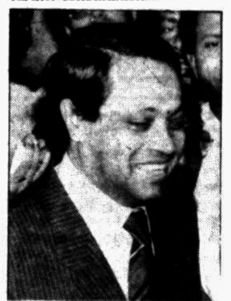
Moudud Ahmed Barrister Moudud Ahmed, the Jatiya party leader, then