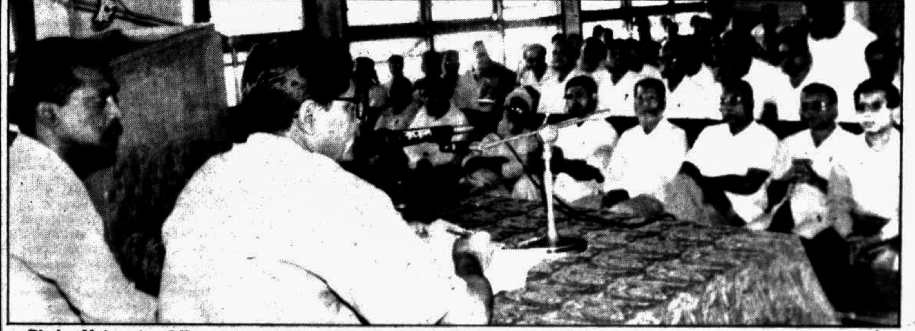
Dhaka University Officers' Association went on strike on Monday to realise their demands. The office-bearers and members of DUOA met at TSC to decide on future action programme.