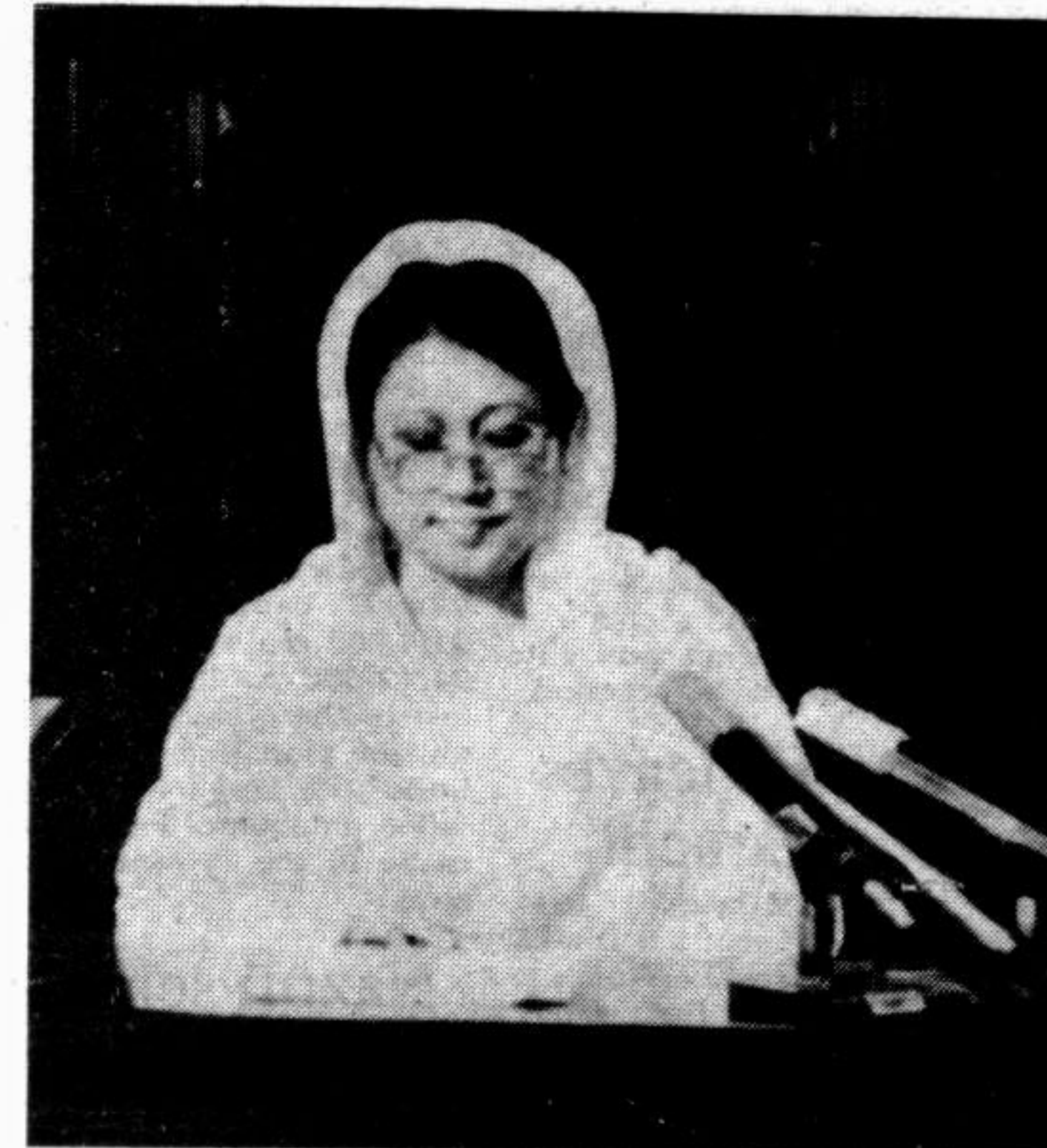
Parliament is going to take a historic decision, Begum Zia tells nation over Radio and Television Monday.

had been the commitment of the BNP that the system of government should be decided by the Jatiya Sangsad. The Prime Minister said no system of government, could guarantee democracy unless it was motivated by sincere desire, and unstinted love and affection for the people to establish their rights. She said it had been considered necessary under the changed circumstances, at a given context of time, to evolve the system of government. She said it was the stand of her party that the Jatiya Sangsad alone would take a decision on the form of government. She said to meet the needs of time BNP never hesitated in the past and shall not hesitate in future too to take any constitutional step to ensure democracy, stability and greater national interest. Begum Zia recalled, in this connection, that in 1975 one party system was introduced in place of parliamentary form of