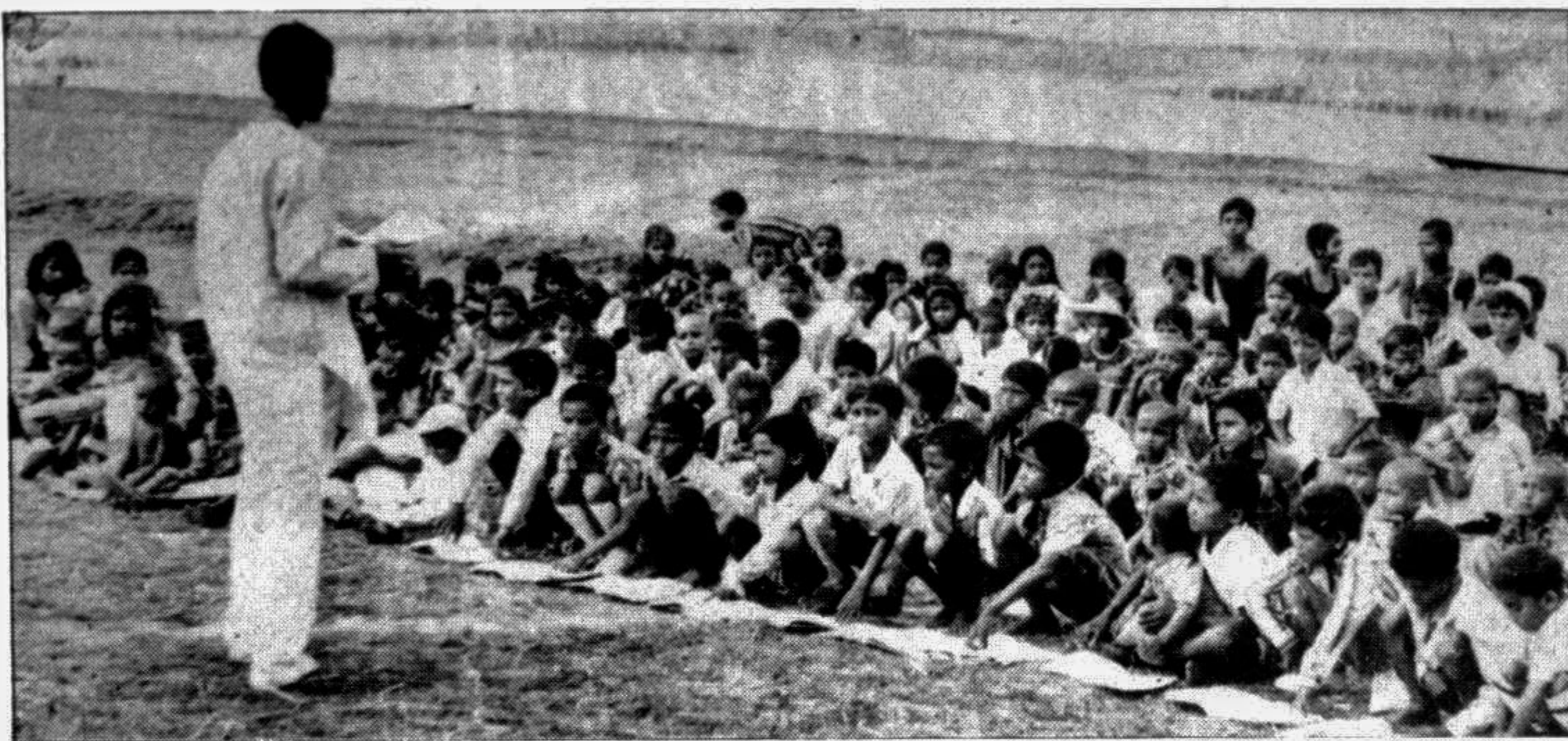
Universal primary education programme faces a setback. Photo shows children taking lesson under the open air having no school building or a shed at a remote village in Noakhali.

Local Upazila chairman, central and local leaders of the Jubo Dal also addressed the meeting.