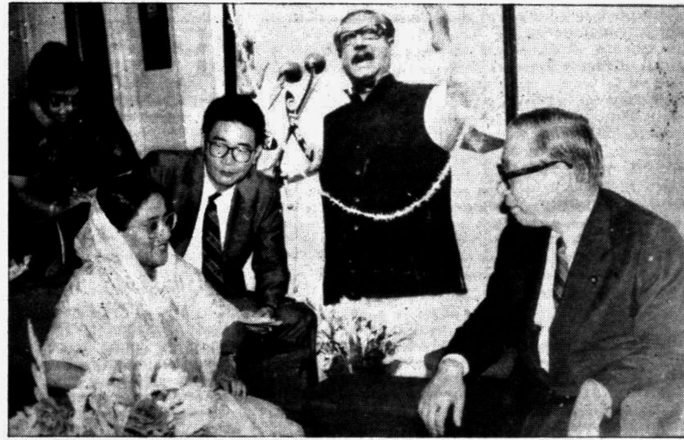
Japanese parliamentary delegation led by Masayoshi Takemura called on Leader of the Opposition in Parliament and Awami League chief Sheikh Hasina at Bangabandhu Bhaban on Sunday.