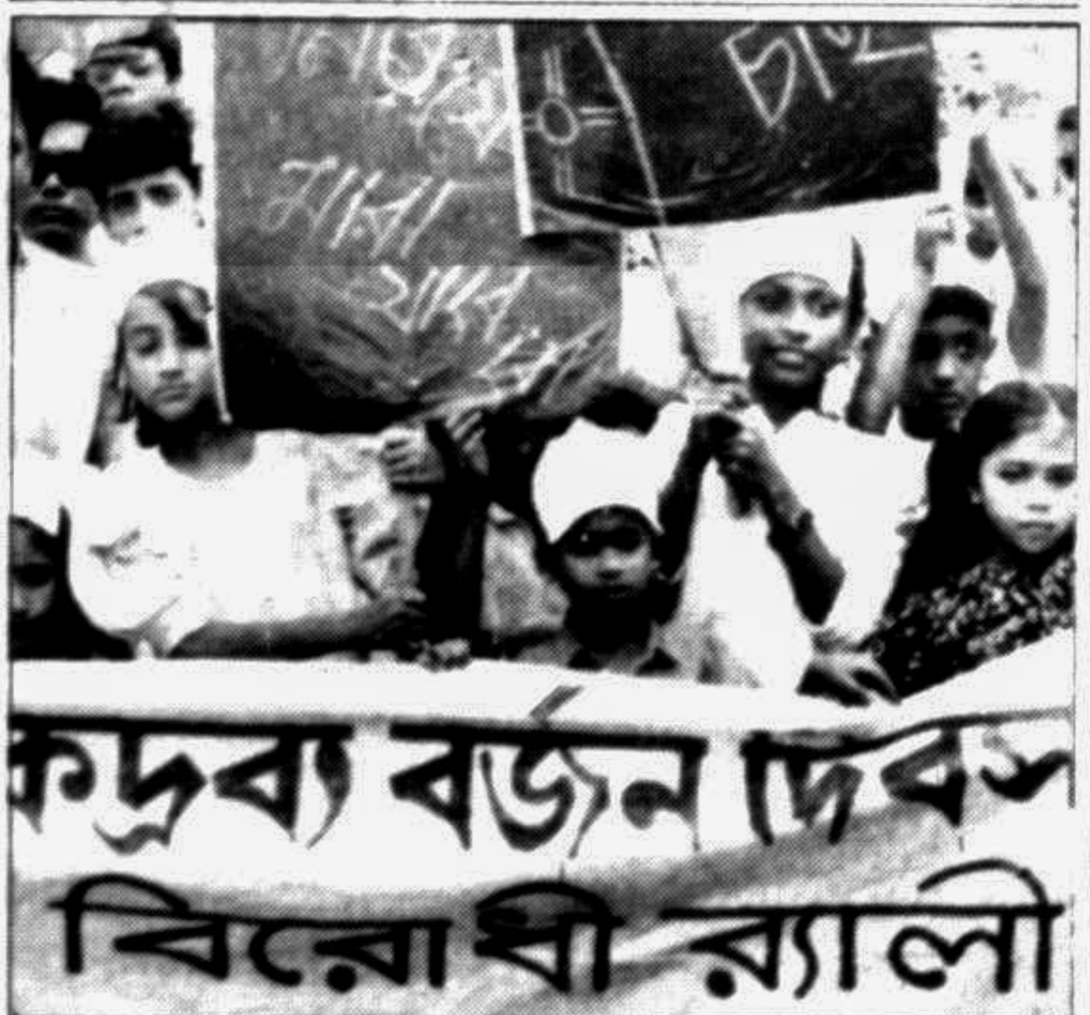
An anti-drug procession in the city to mark the occasion of International Day against Drug Abuse and Illicit Trafficking which was observed worldwide Wednesday (Story on Page 10).

Rao said that it would be the endeavour of his govern- ment to restore India to its See Page 10 Col. 7