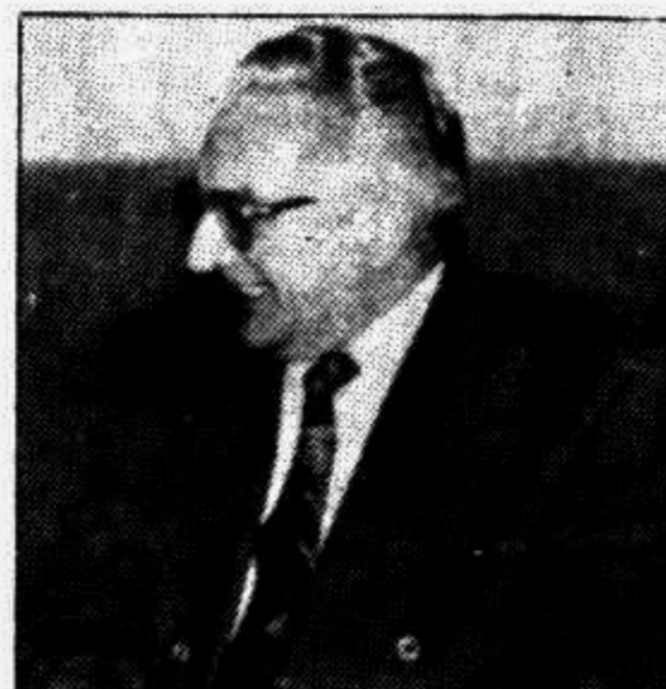
Franjo Tudjman, President of Croatia, one of the two Yugoslav republics, which have declared independence.

The federal government, representing all six con- stituent republics and two provinces, responded rapidly. See Page 10 Col. 1