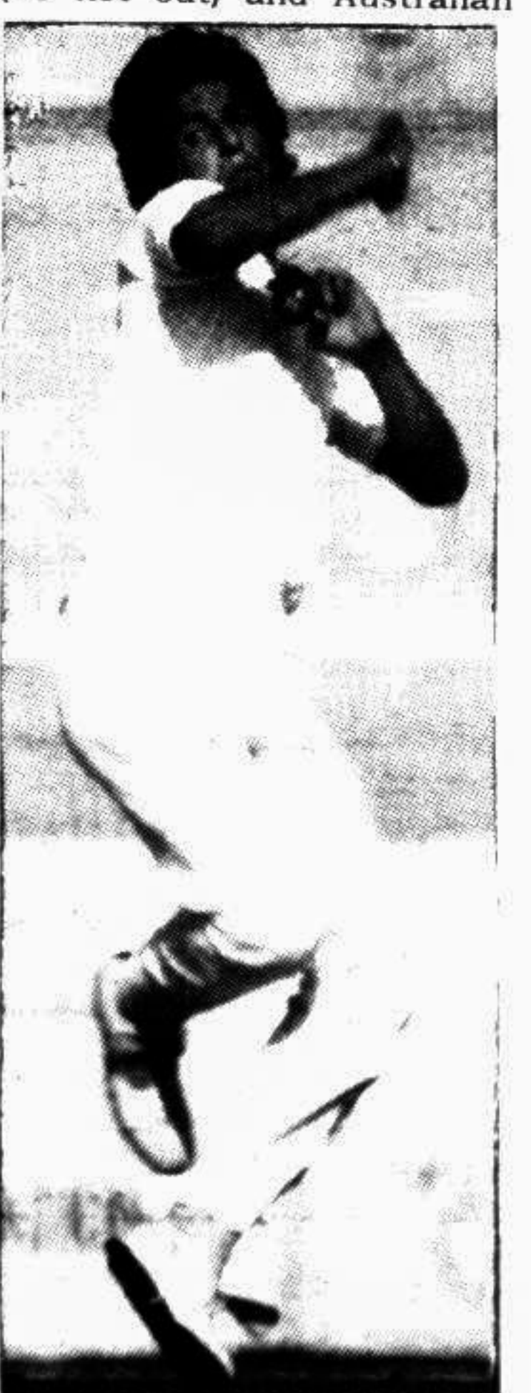
WASIM AKRAM — in fine form.