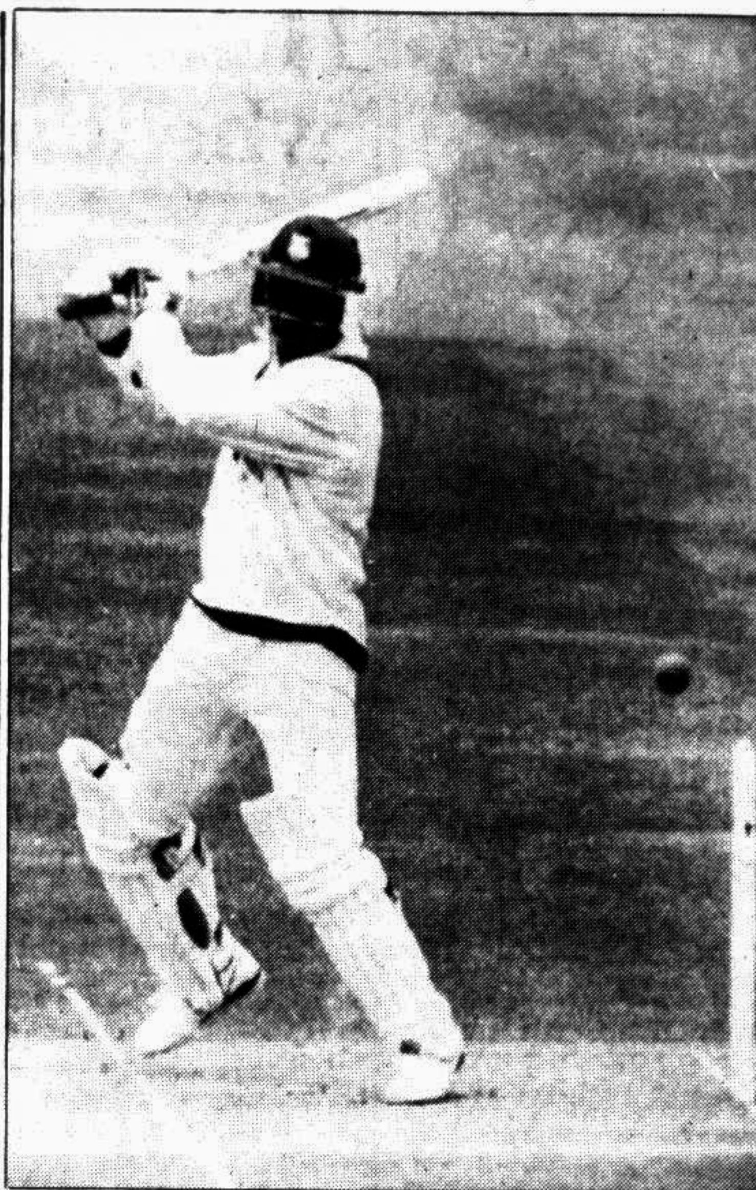
Desmond Hayes of the West Indies puts the ball past the slips off the bowling of Phillip DeFreitas in the 2nd Test match between England and the West Indies at Lords on Thursday.

England first innings Gooch not out 8 Atherton b Ambrose 5 Hick c Richardson b Ambrose 0 Lamb c Haynes b Marshall 1 Extras (nb2) 2 Total (3 wkts) 16 Fall of wickets: 1-5, 2-7, 3-16.