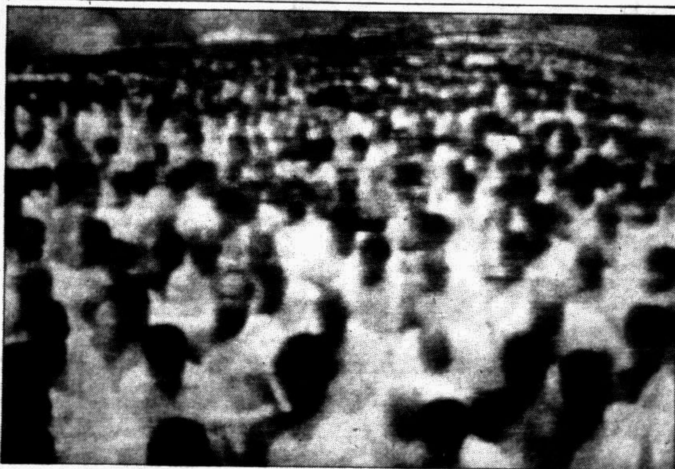
PILGRIMAGE TO MAKKAH: Millions of Muslims from throughout the world, who have converged at Arafat are offering prayer during the Hajj Friday.