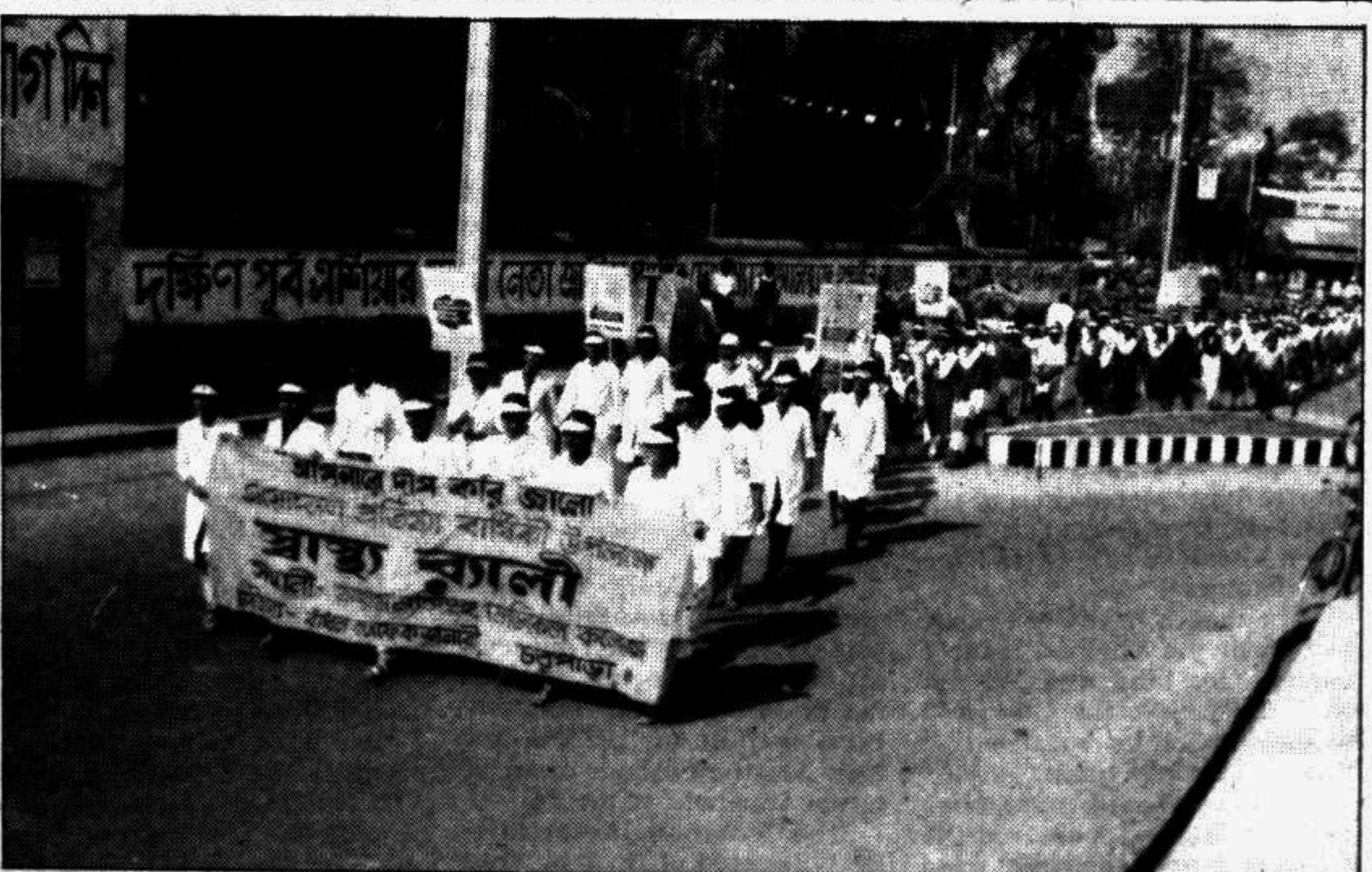
MYMENSINGH: Sandhani, Mymensingh Medical College unit brought out a health rally on the occasion of its 13th founding anniversary at the town recently.

He has a 30 years' teaching experience. Besides, he is the author of 16 scientific research publications and two text books of degree-level.