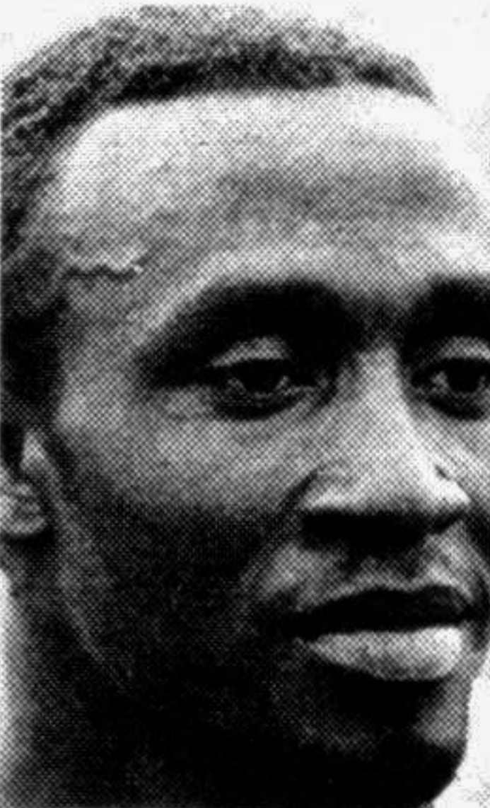
LINFORD CHRISTIE — the conqueror.

LONDON, June 20: Britain's European Cup preparations were re-hit by a series of hiccupps as three of Linford Christie's front-line troops suffered shock defeats in the historic international against Germany at Crystal Palace on Wednesday, reports AFP. While Christie led by example with a brilliant sprint double and his men ran out overwhelming winners against their formidable rivals — there were unwelcome reverses for Tom McKean, Colin Jackson and Peter Elliott. Christie's triumph helped Britain's men squeeze to a 198-197 triumph, while Germany's women won 169-133. What should have been a perfect dress rehearsal for Britain's bid to retain the Cup in Frankfurt next week was tarnished by McKean's loss to brian Whittle in the 800m. Jackson's sluggish hurdles loss Tony Jarrett and Elliott's tactical ineptitude in the 1,500m. But with Roger Black recording a magnificent 400m win and other morale-boosting triumphs for Kriss Akabusi and Steve Backley, chances of a repeat of the Gateshead triumph two years ago are still high. But Christie must have been