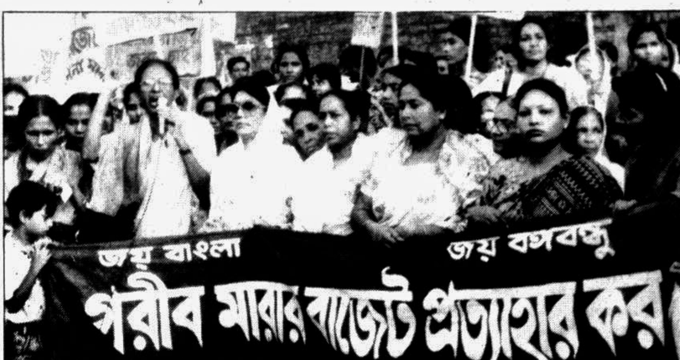
Bangladesh Mahila Awami League brought out a procession in city on Thursday demanding withdrawal of proposed national budget.

In observance of the Day, the Dhaka Ahsania Mission in co-operation with United Nations Information Centre (UNIC) in Dhaka will organize a discussion meeting at UNIC premises on June 26 at 4.00 pm