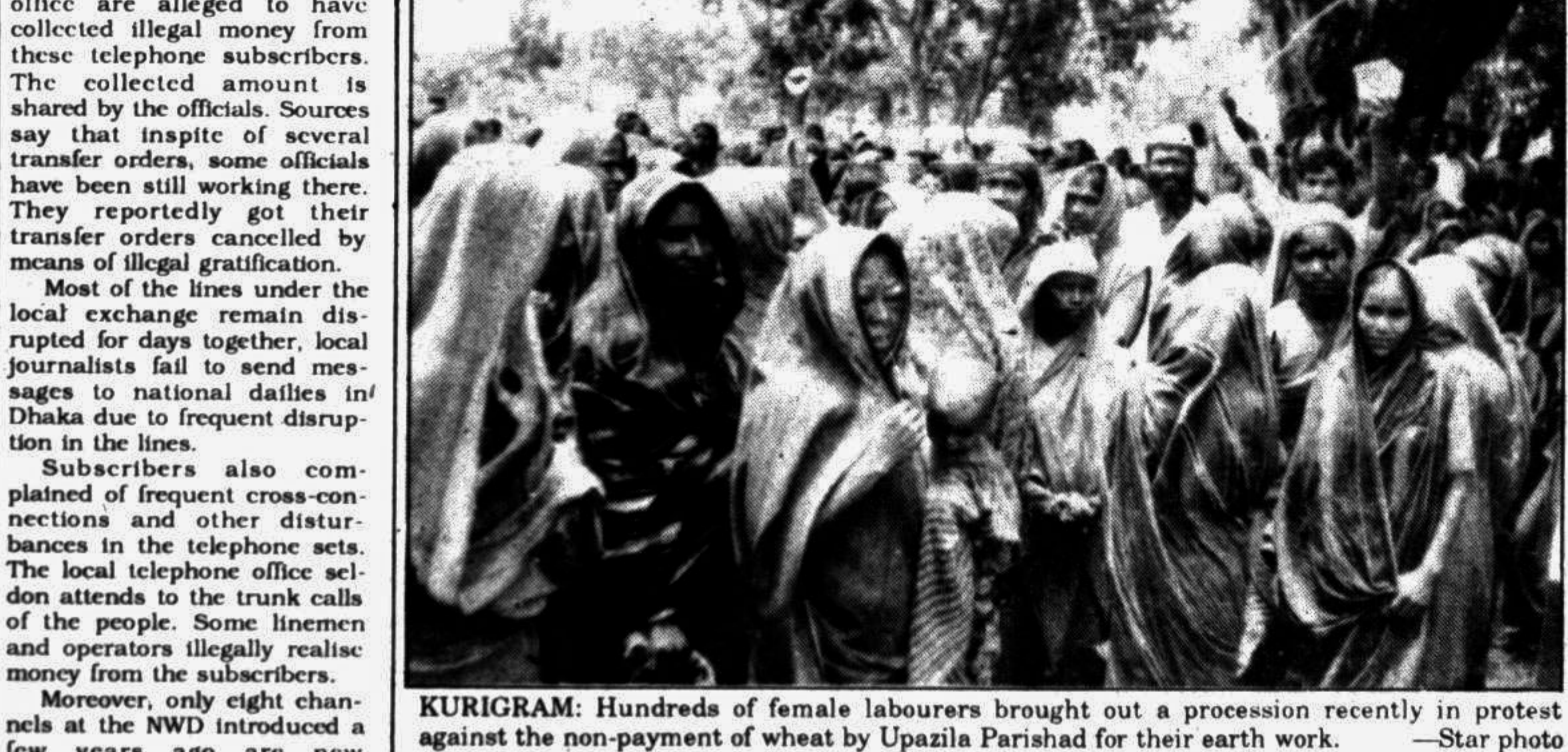
KURIGRAM: Hundreds of female labourers brought out a procession recently in protest against the non-payment of wheat by Upazila Parishad for their earth work.