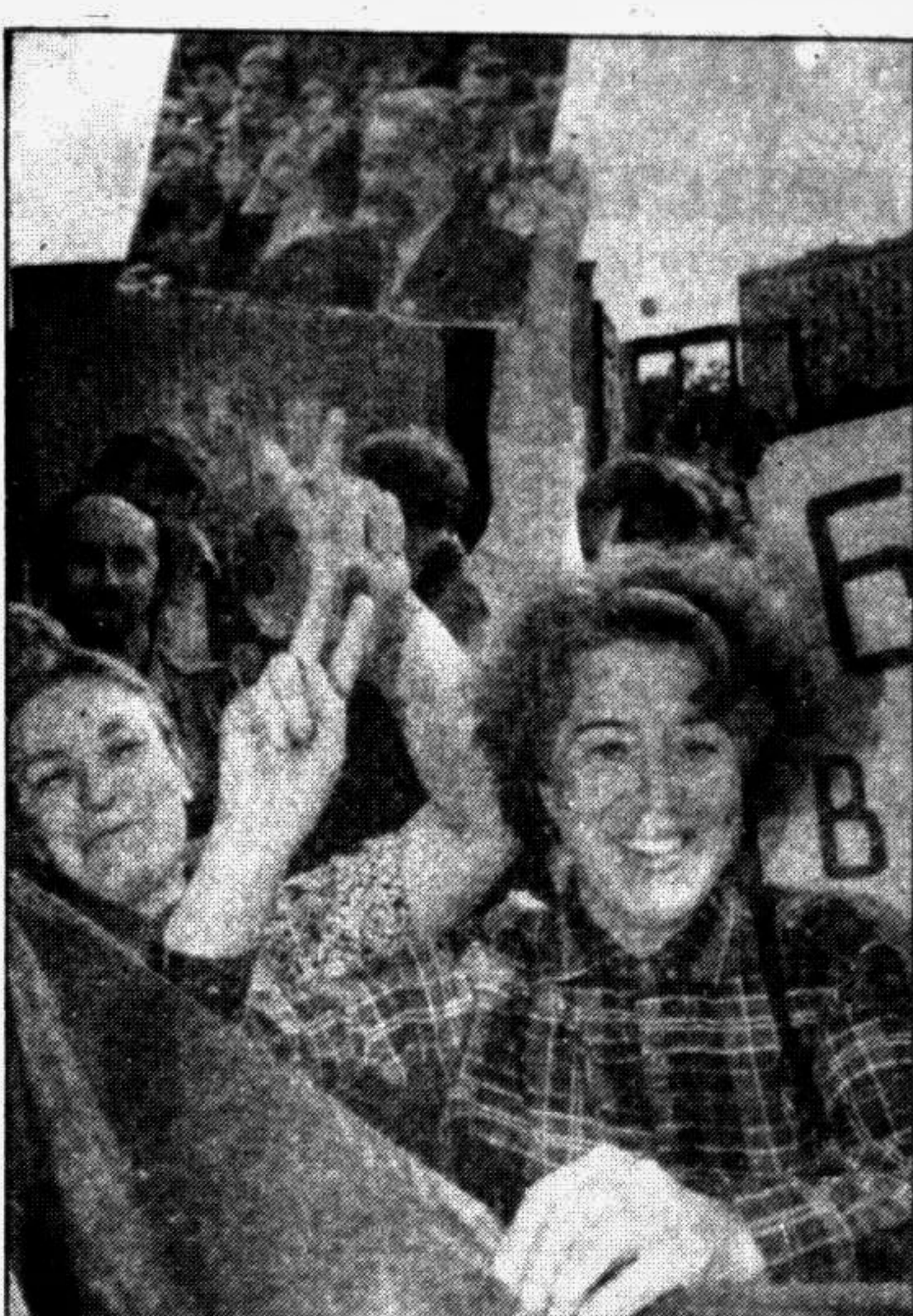
MOSCOW: Supporters of Russian President-elect Boris Yeltsin celebrate his victory in Moscow's Pushkin Square Thursday.

Mrs Gandhi, who continues to live in her husband's heavily guarded home on Janpath Road, is obsessed with worries for her children's security