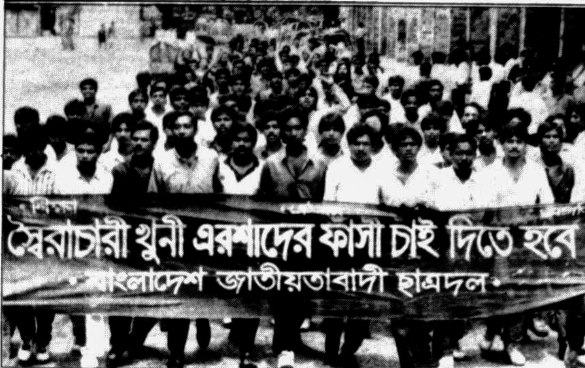
JCD rally in city on Wednesday demanding death penalty to deposed President H M Ershad.