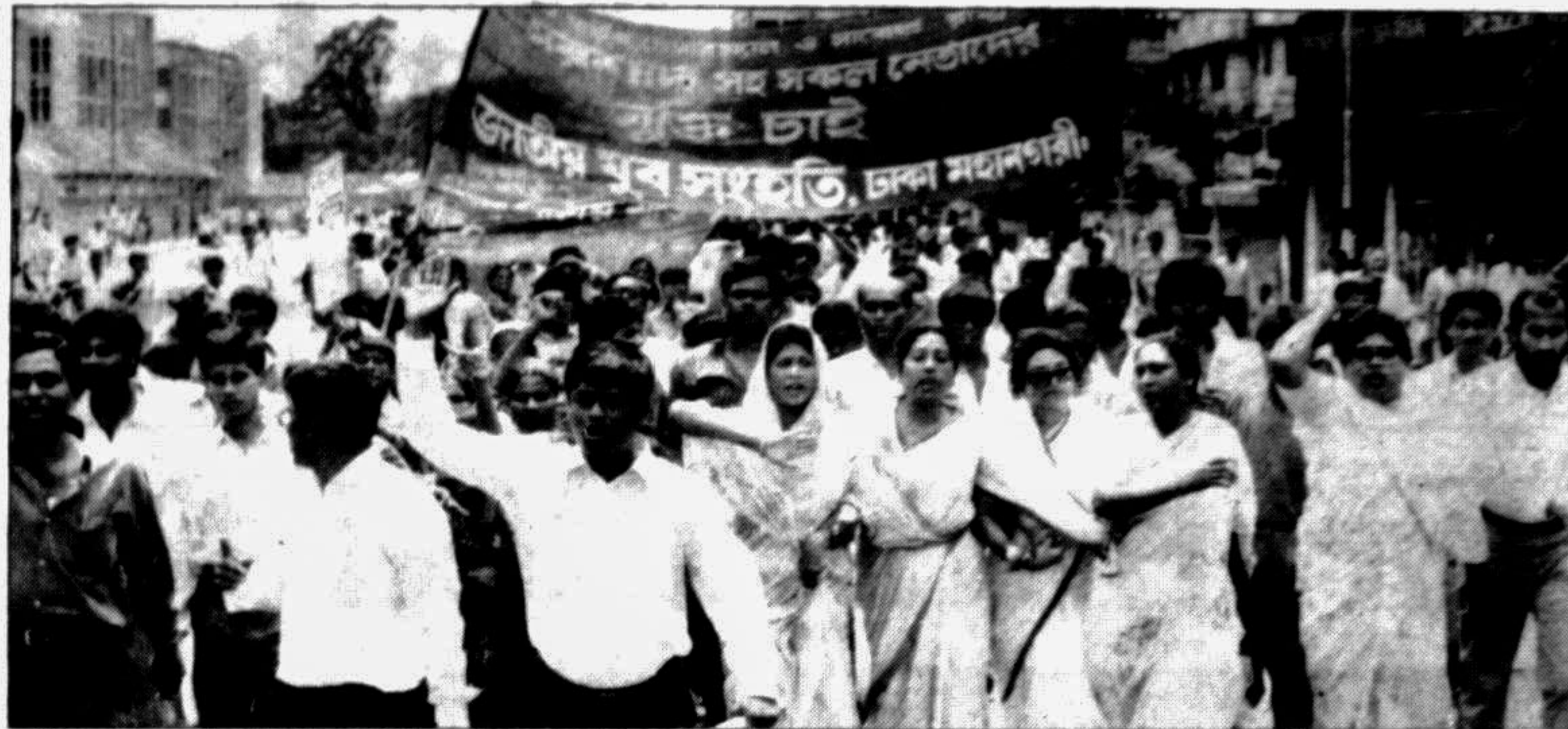
Jatiya Jubo Sanghati, youth front of the Jatiya Party, brought out a procession in the city on Wednesday demanding release of HM Ershad and other party leaders.